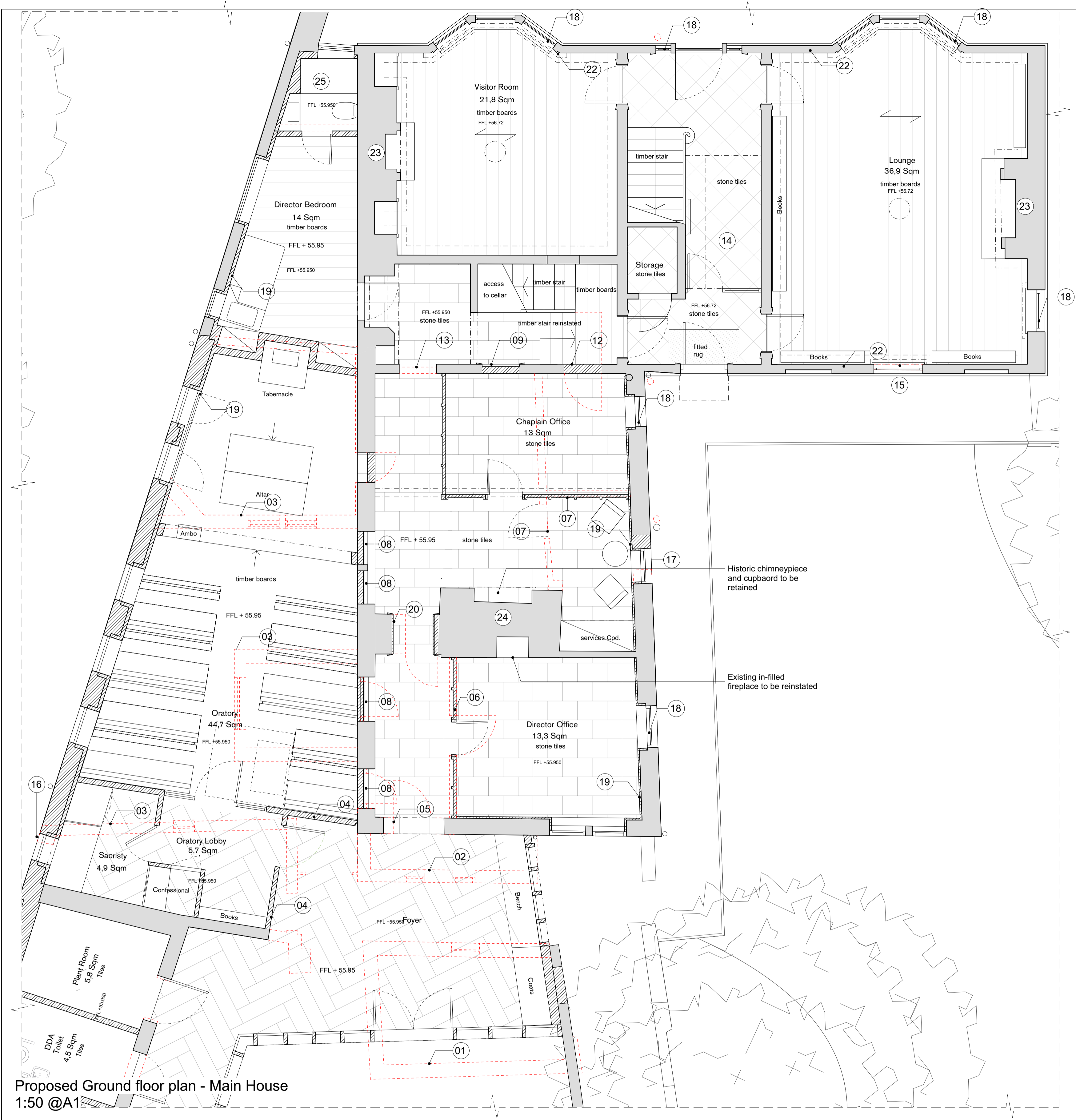
Proposed Ground floor plan - Main House 1:50 @A1