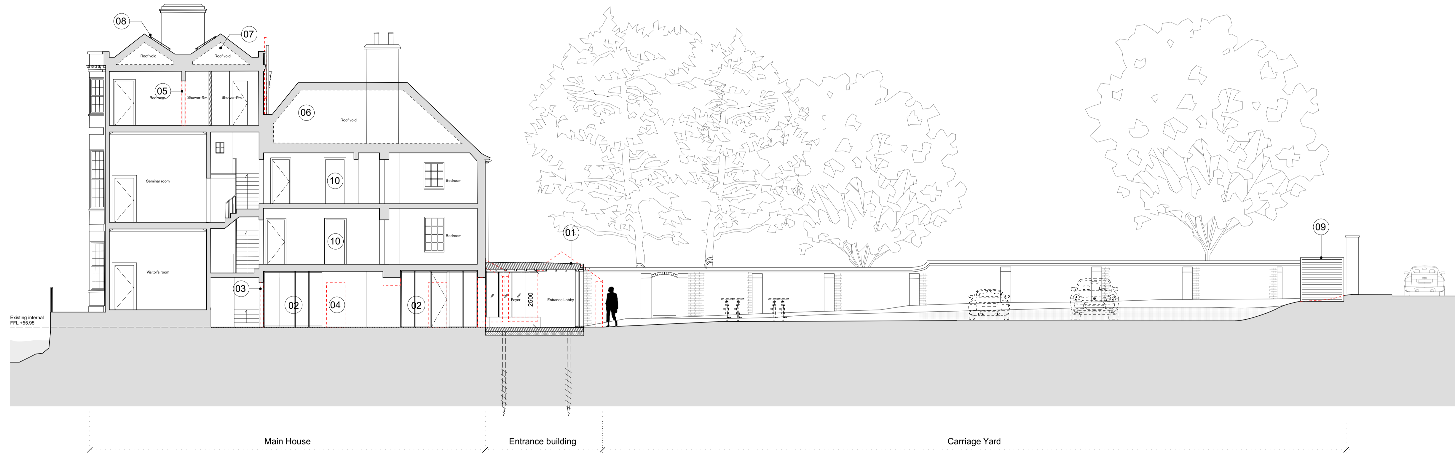
Proposed Section S01 1:100 @A1