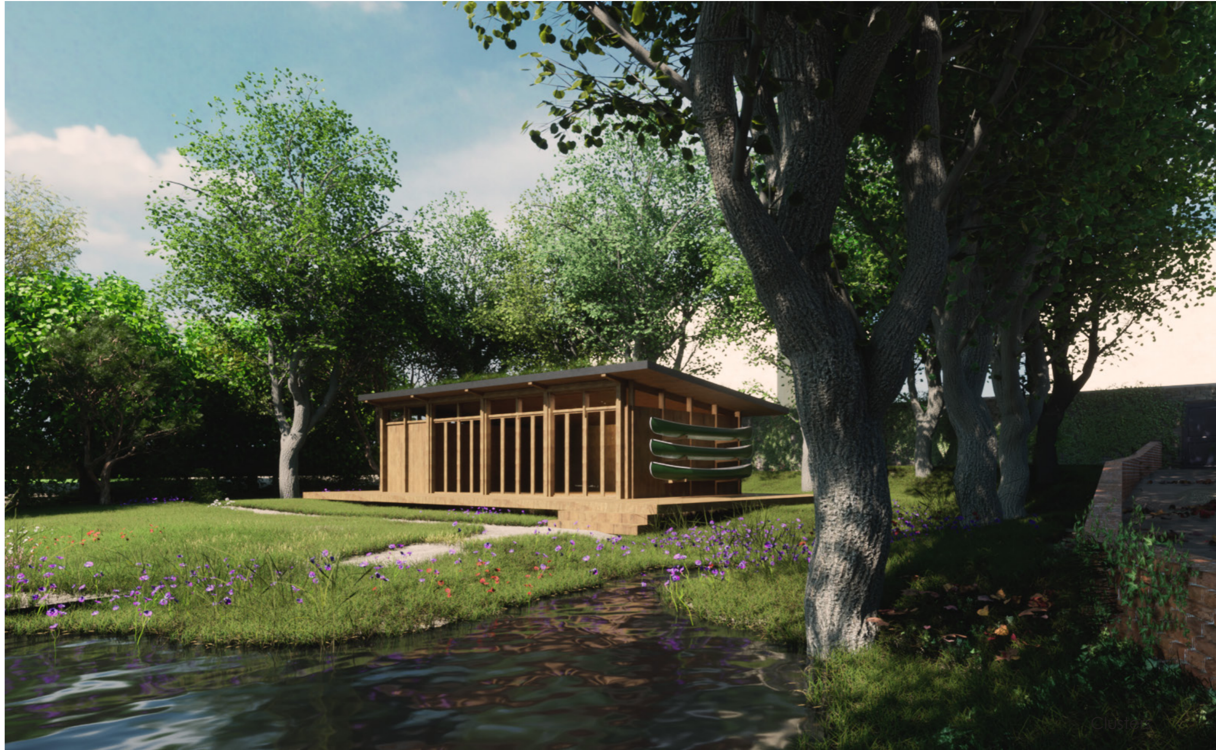
Image 57: Visualization of proposed boat house seen from the pedestrian walkway