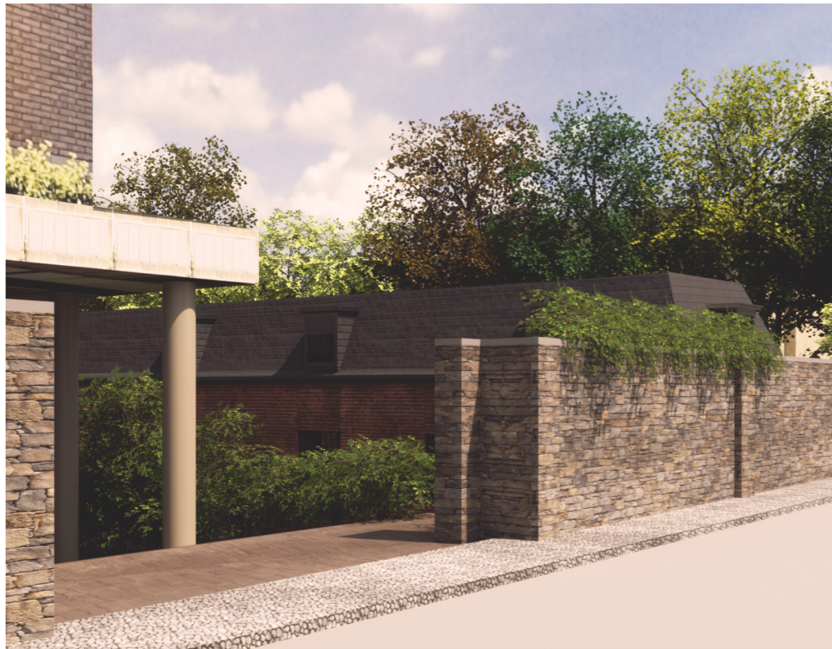
Image 51: View looking south of Abingdon Road to the proposed stable block mansard roof at Pre-planning Applicant Stage showing a roof slope of 70 degrees with end dormer window