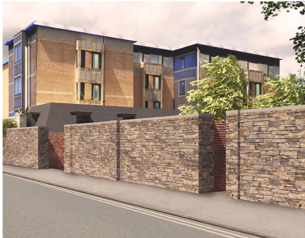
Image 53: View looking north of Abingdon Road to the proposed stable block mansard roof at Pre-planning Applicant Stage showing a roof slope of 70 degrees with end dormer window