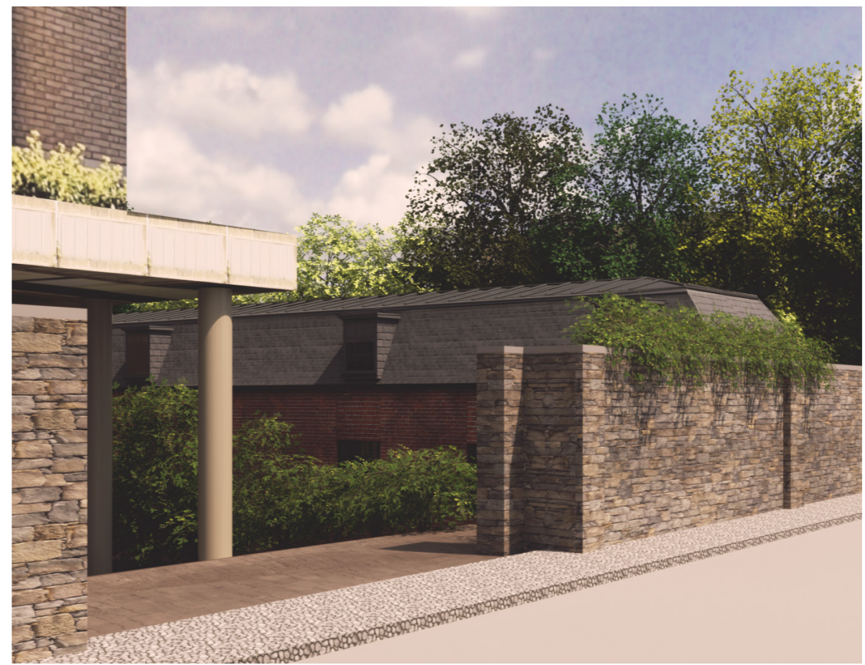
Image 52: View looking south of Abingdon Road to the improved proposed stable block mansard roof showing a reduced pitch slope of 50 degrees and dormer window removed