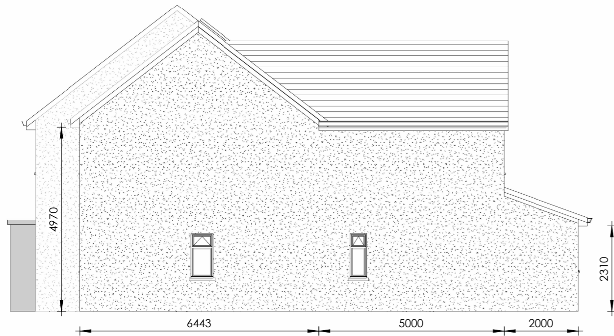
Proposed Side A Elevation