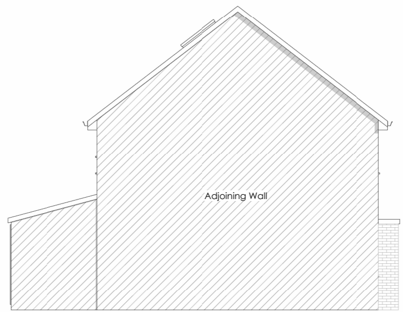
Existing Side B Elevation