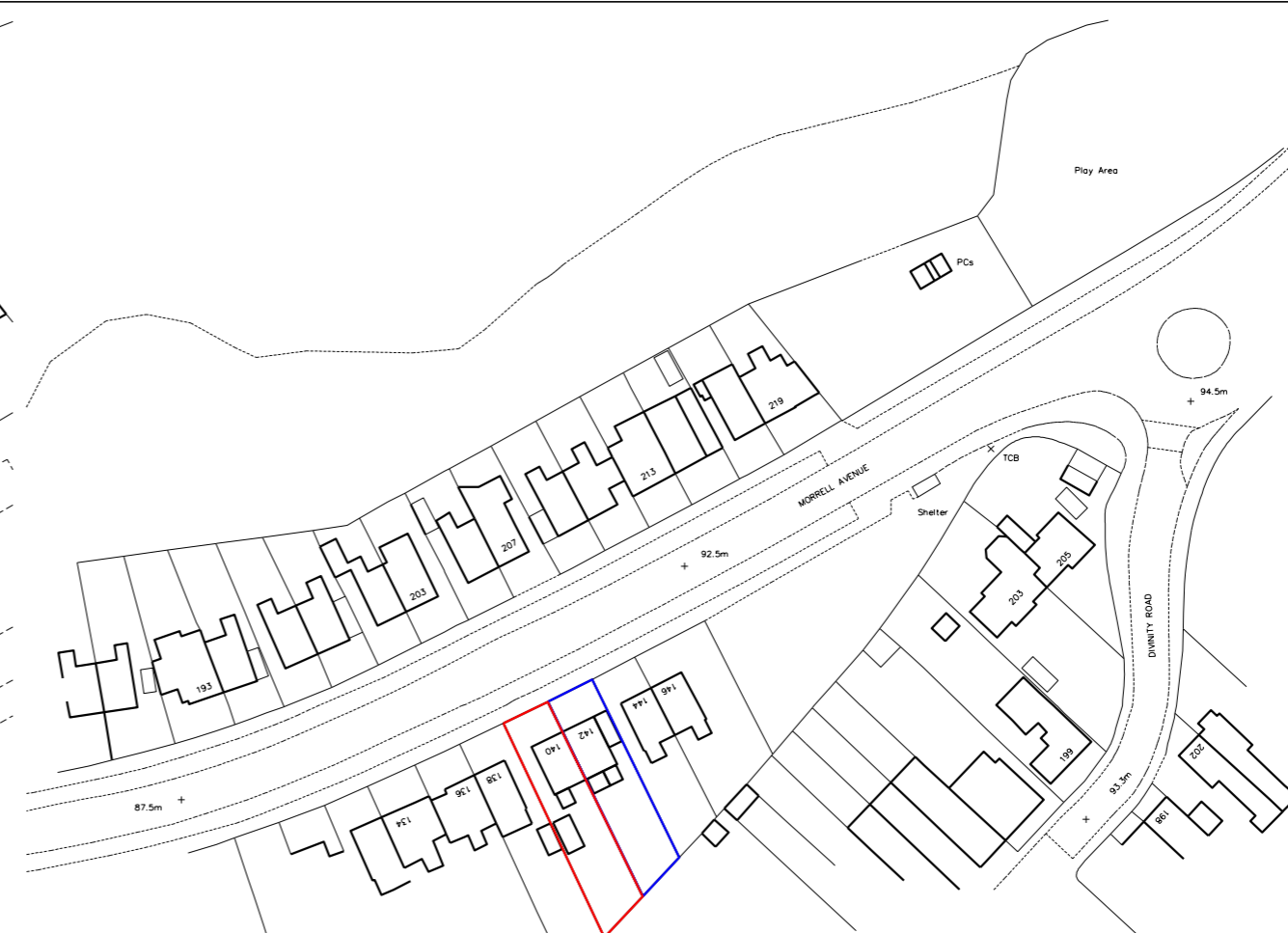
02 - Location Plan Scale 1:1250 @ A3