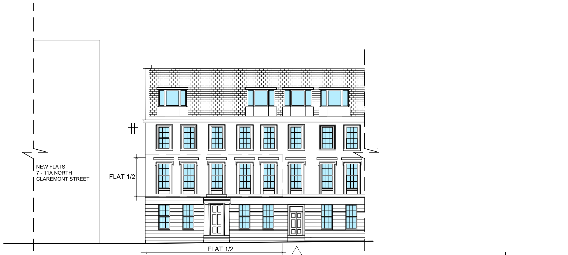
EXISTING FRONT ELEVATION 1:200

DIMENSIONS N.B any variations between stated dimensions and site dimensions should be reported to the Architect prior to work being executed.