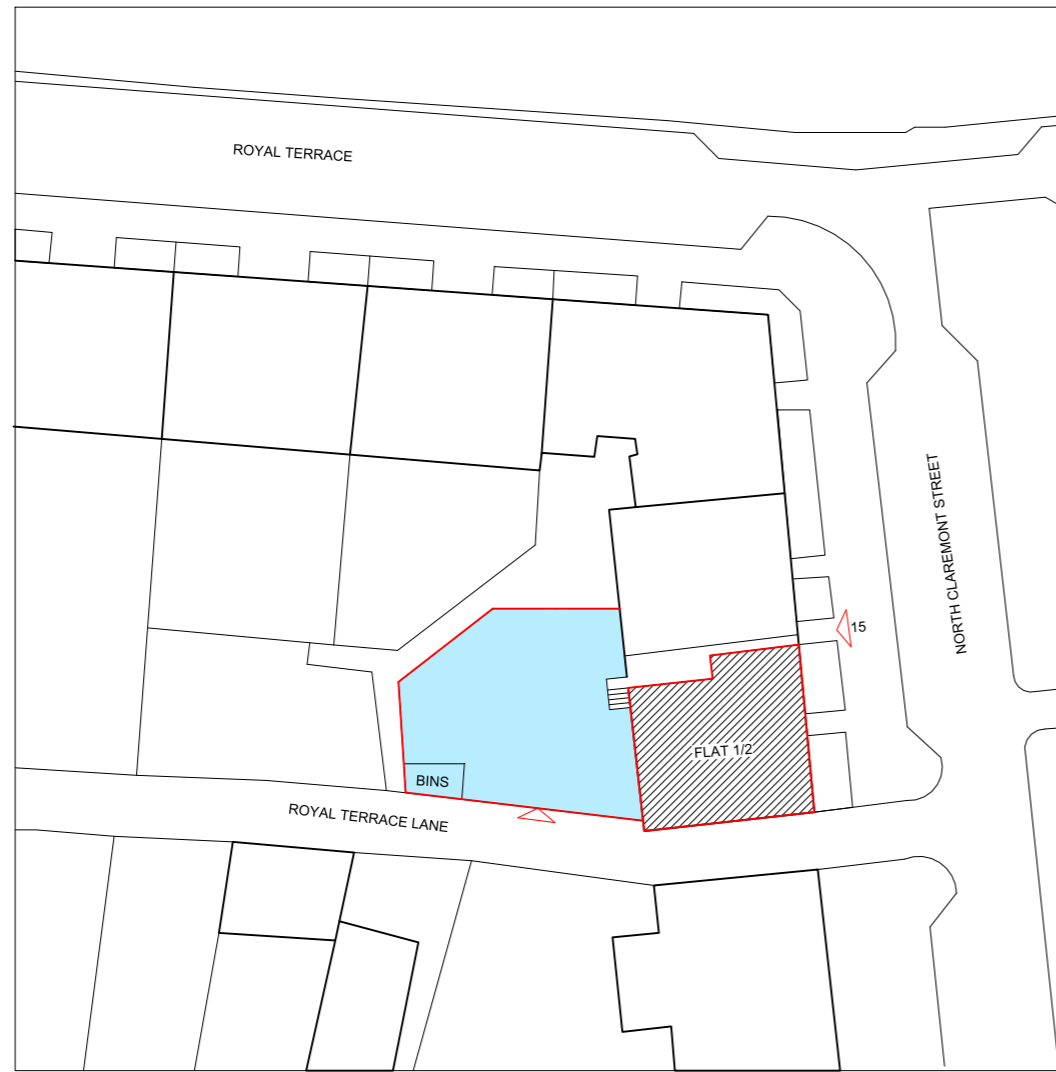
COMMON AREA BLOCK PLAN 1:500

DIMENSIONS N.B any variations between stated dimensions and site dimensions should be reported to the Architect prior to work being executed. THIS DRAWING IS COPYRIGHT. DRAWING STATUS PLANNING APPROVAL This drawing has been produced and submitted as part of a Planning application relating to listed building, flat 1/2, 15 North Claremont St, Glasgow G3 7NR, and is not intended for use by any other person or for any other purpose.