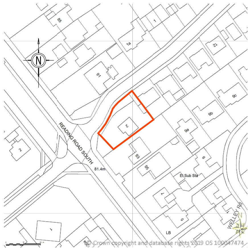
OS map at 1:1250 @ A3