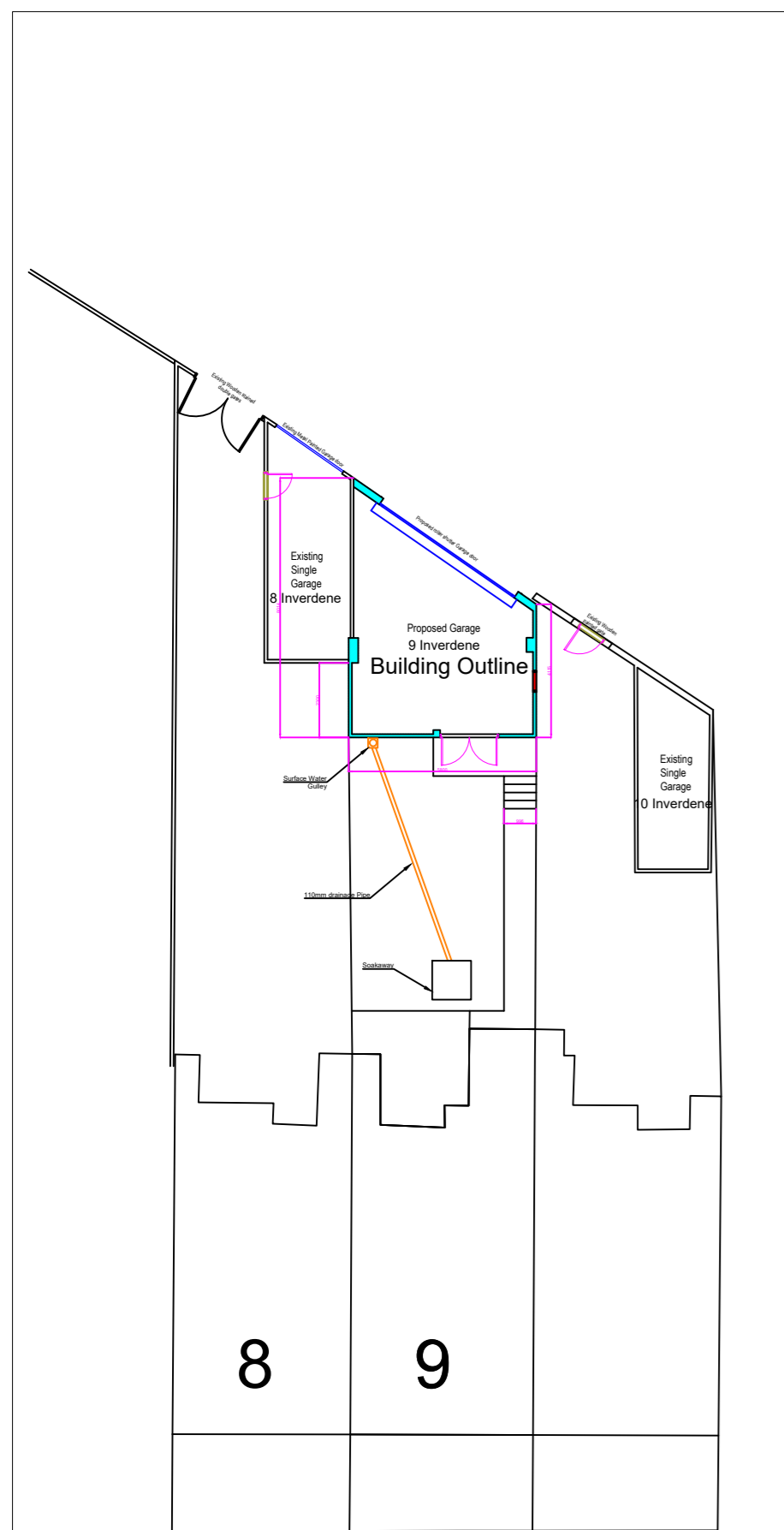
Scale 1:200 @A2