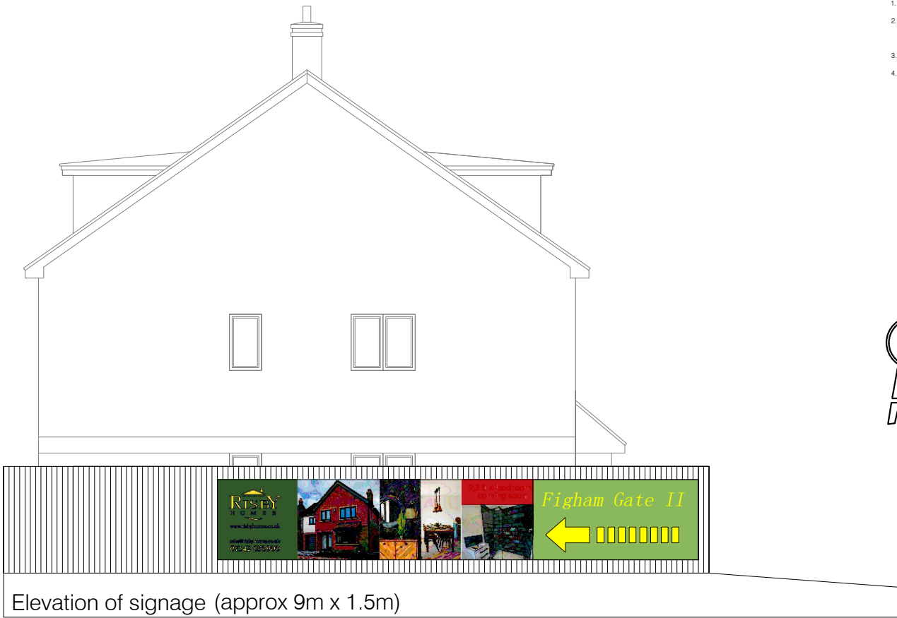
Elevation of signage (approx 9m x 1.5m)