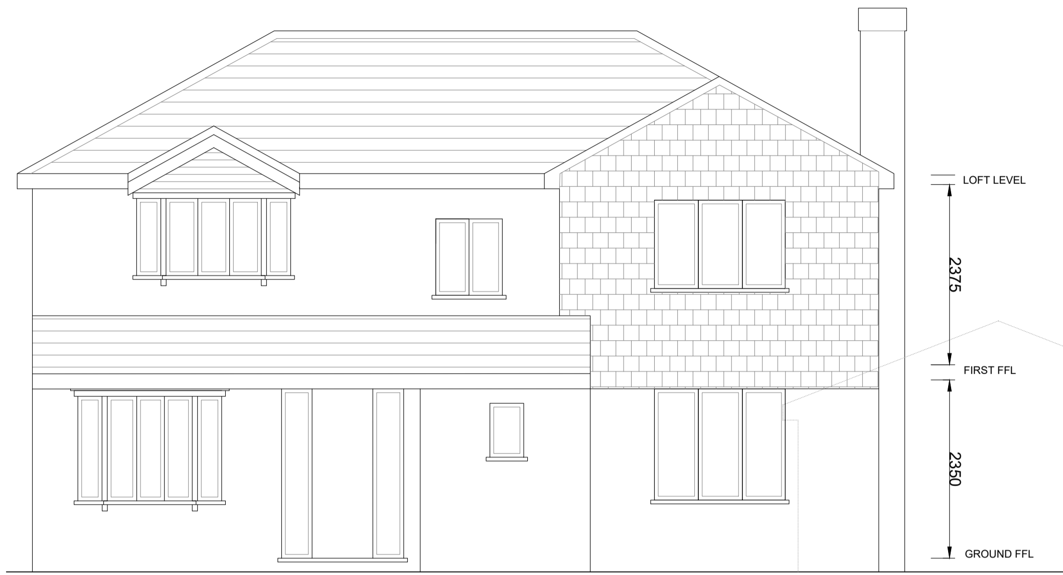
FRONT ELEVATION (UNCHANGED)

NOTE TO CONTRACTOR All figured dimensions are to be confirmed on site prior to construction. All works are to comply with current UK Building Regulations. Any discrepancies are to be reported immediately to the designer. Copyright remains the property of Natalie Horner