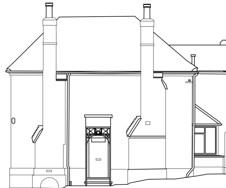
Datum 66.00m North (Side) Elevation