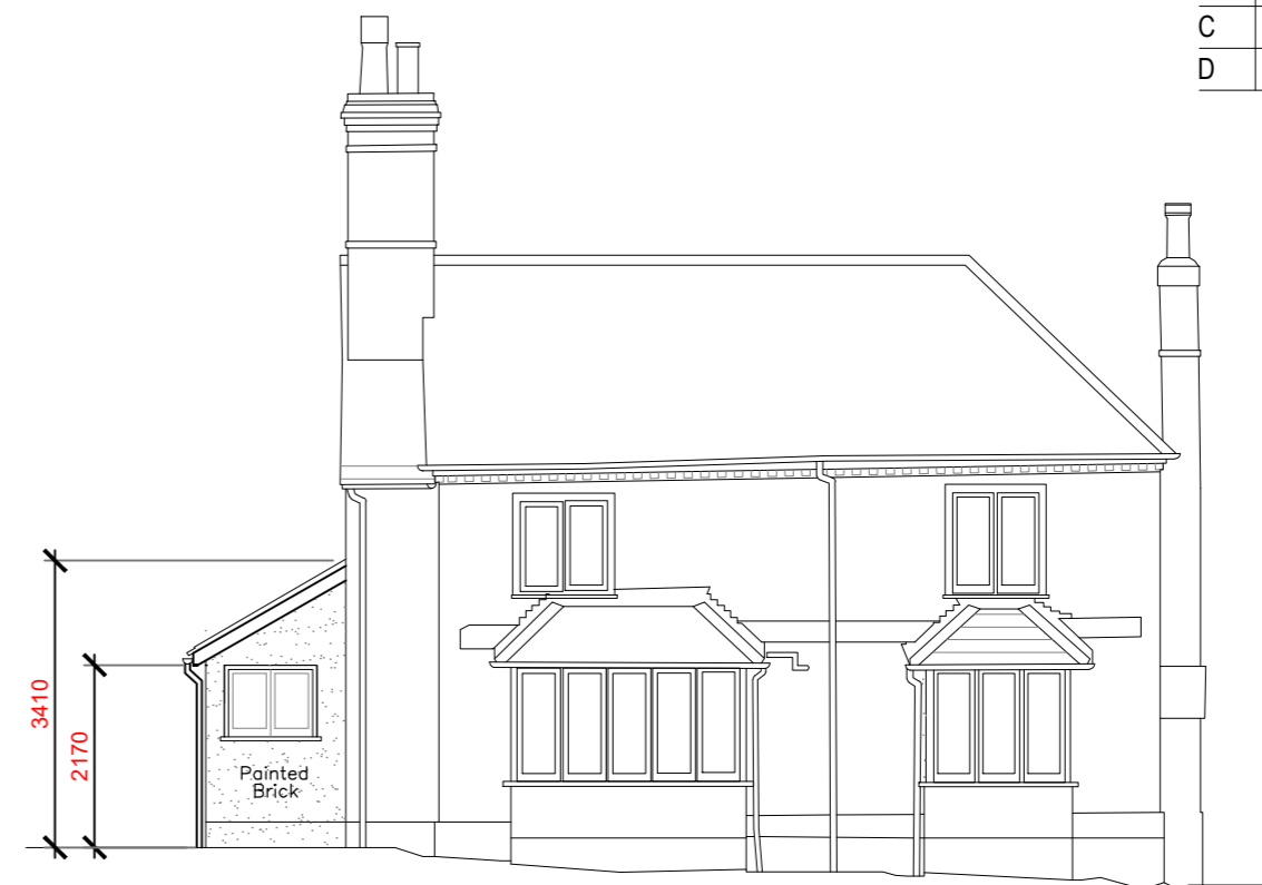
Datum 66.00m East (Front) Elevation