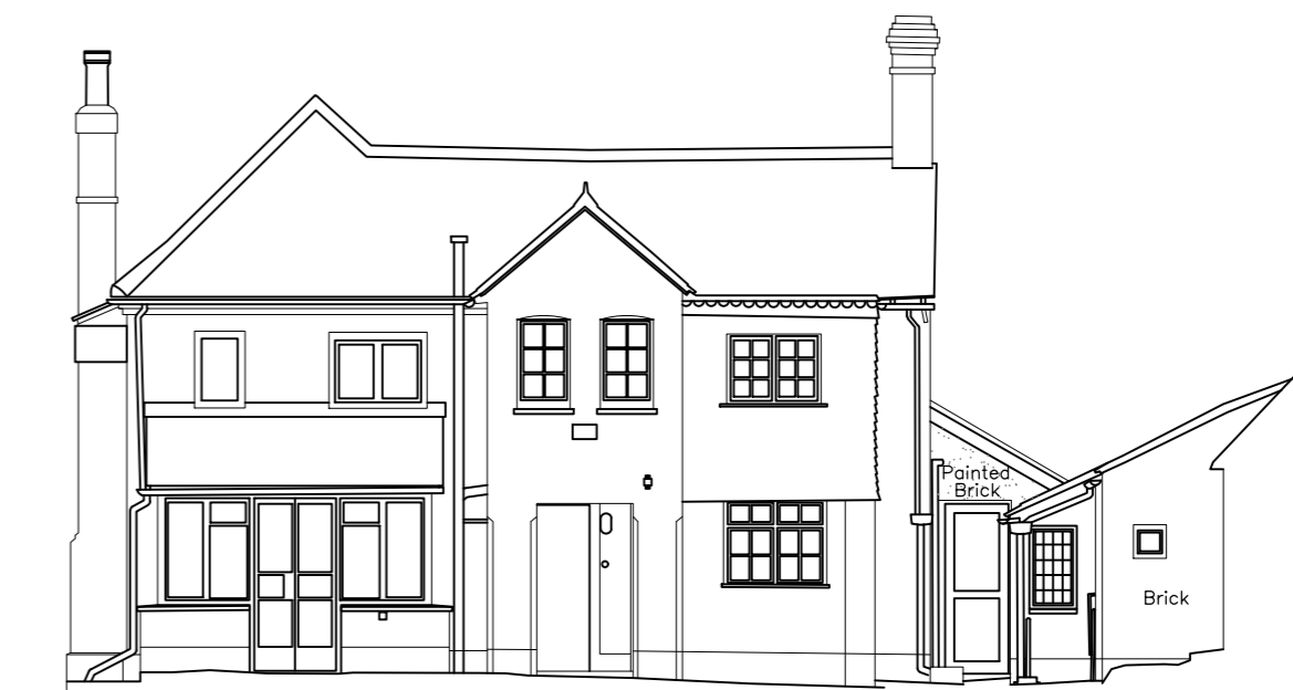
Datum 66.00m East (Front) Elevation