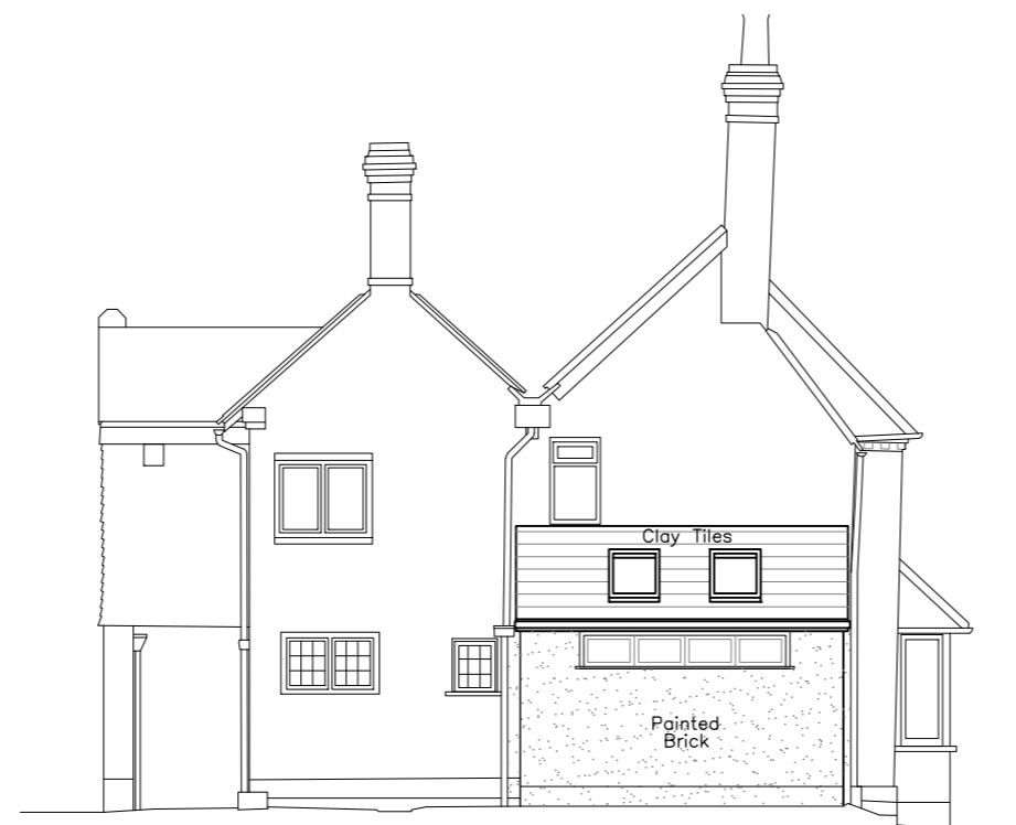
Datum 66.00m South (Side) Elevation