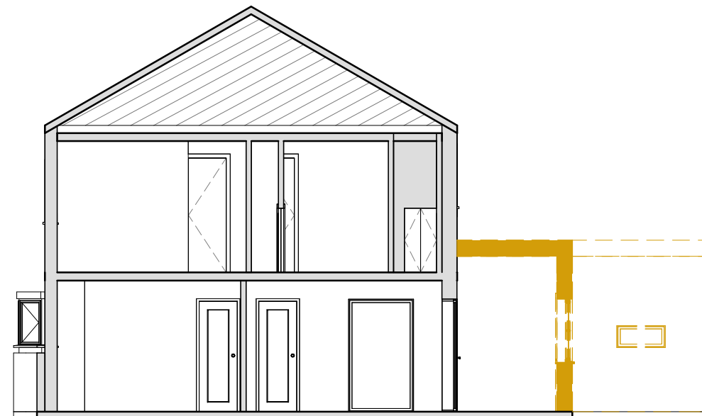
1 Section C-C Demo 1 : 100