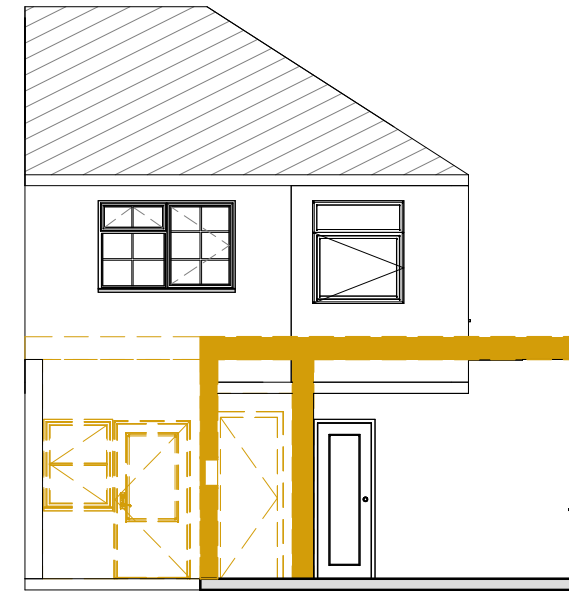
4 Section B-B Demo 1 : 100