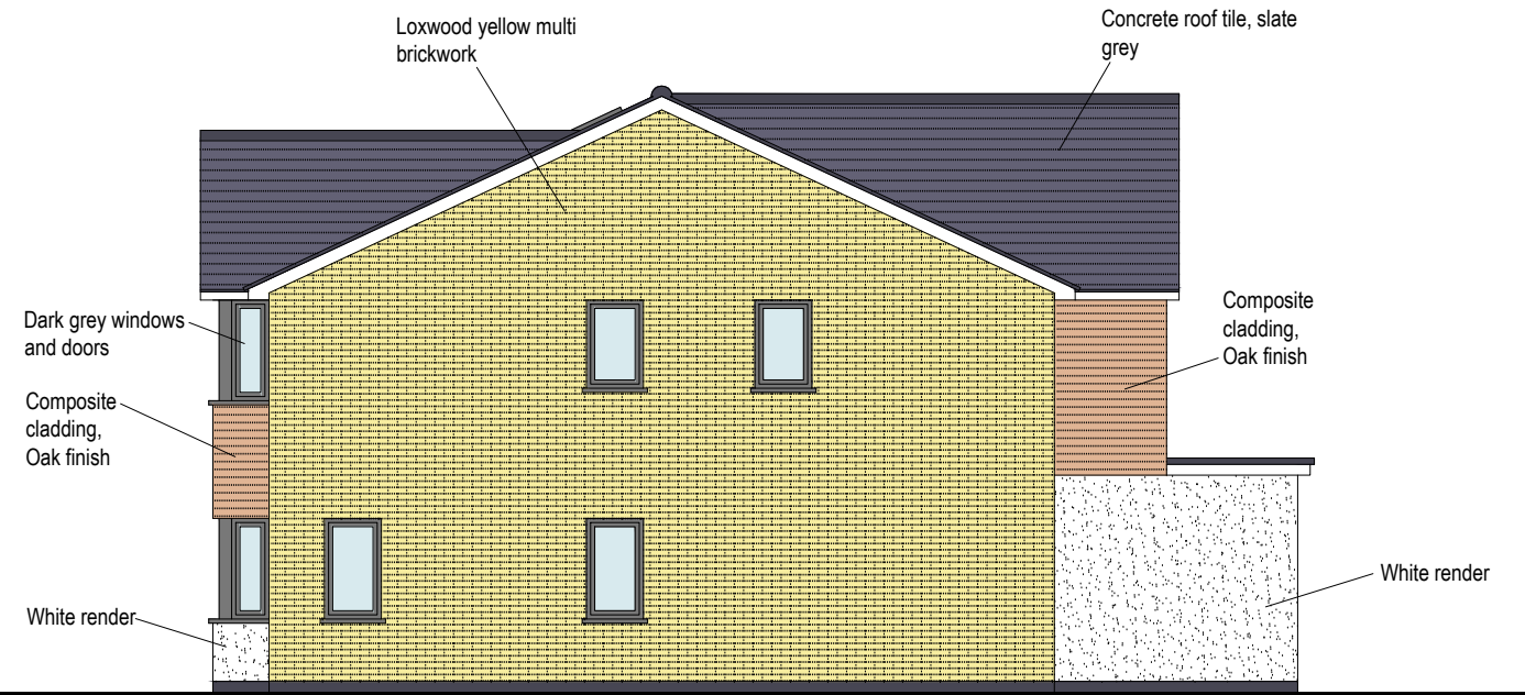
SIDE ELEVATION (South facing)