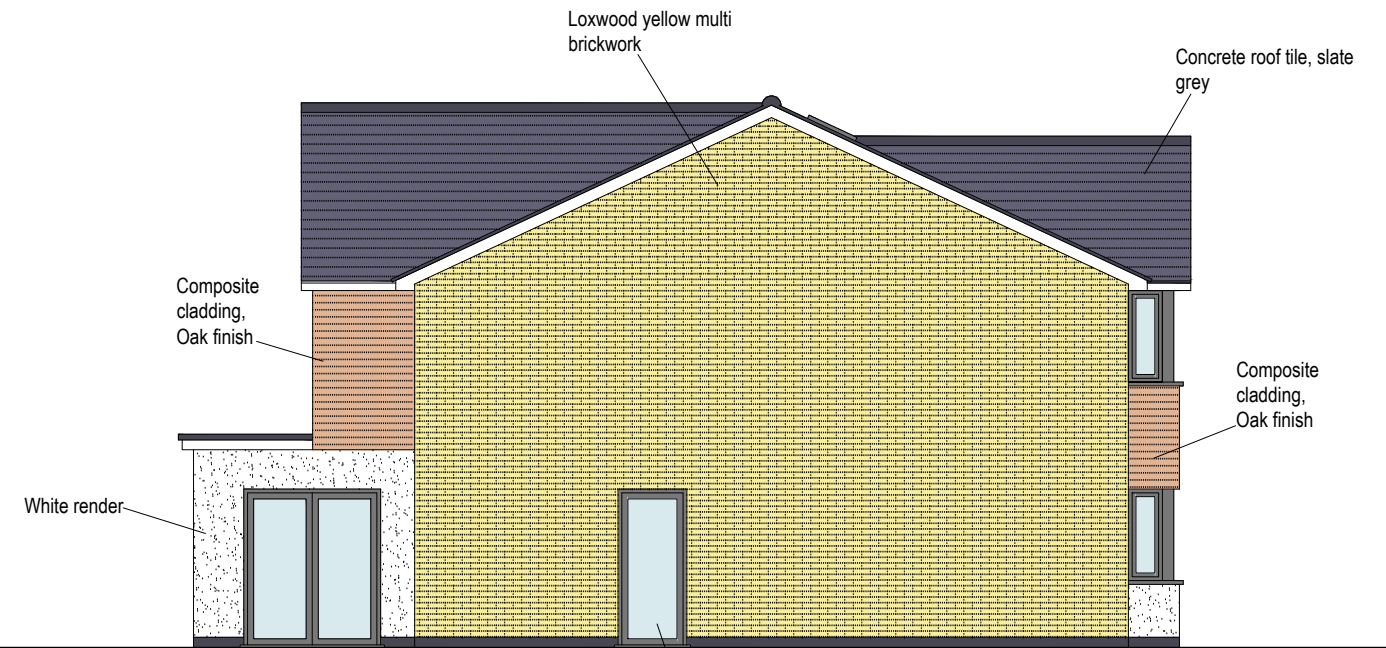
SIDE ELEVATION (North facing)