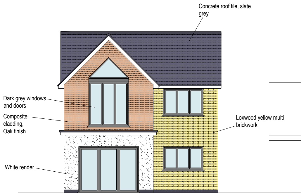
REAR ELEVATION (East facing)