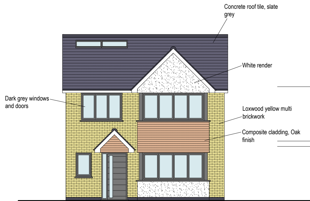
FRONT ELEVATION (West facing)