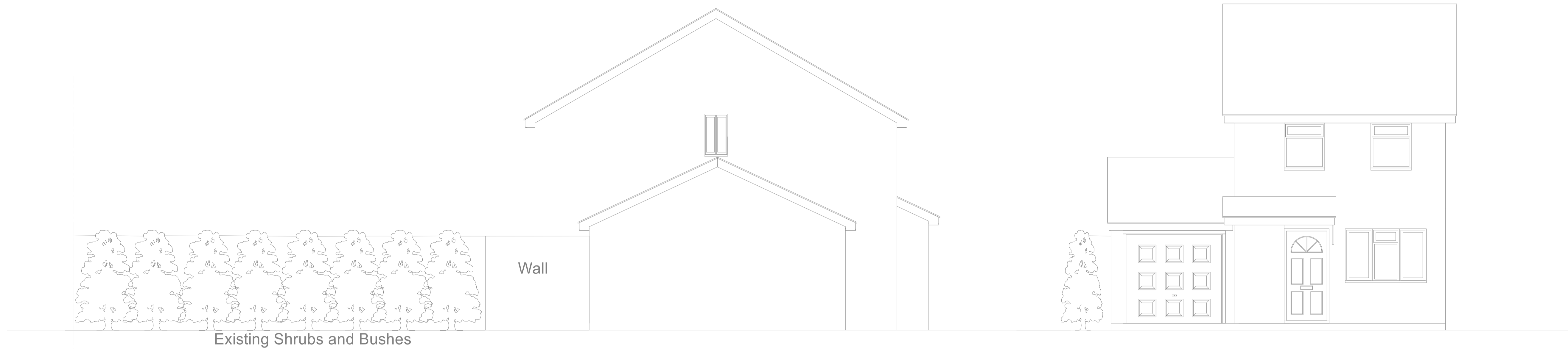
Existing Shrubs and Bushes