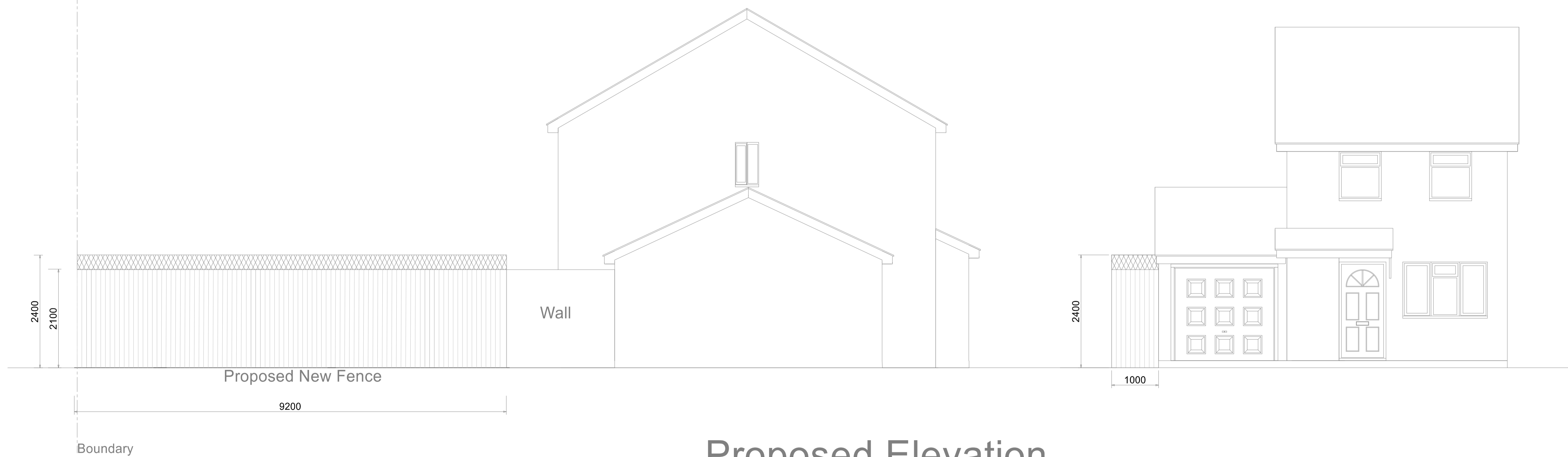
Proposed New Fence