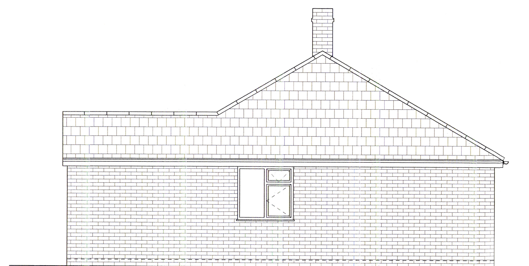
EXISTING WEST ELEVATION 1 : 50