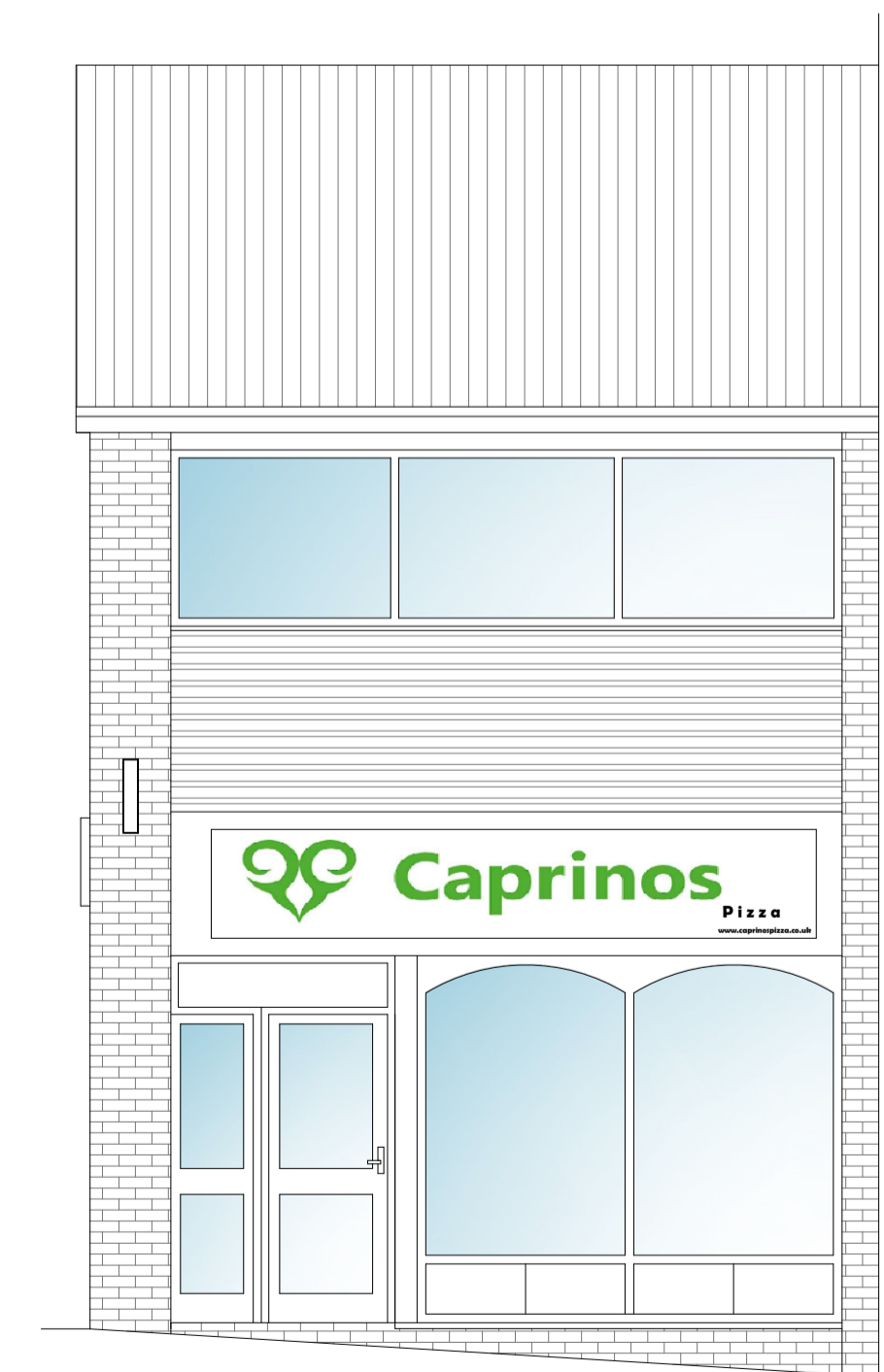
Proposed Front Elevation- 1:50