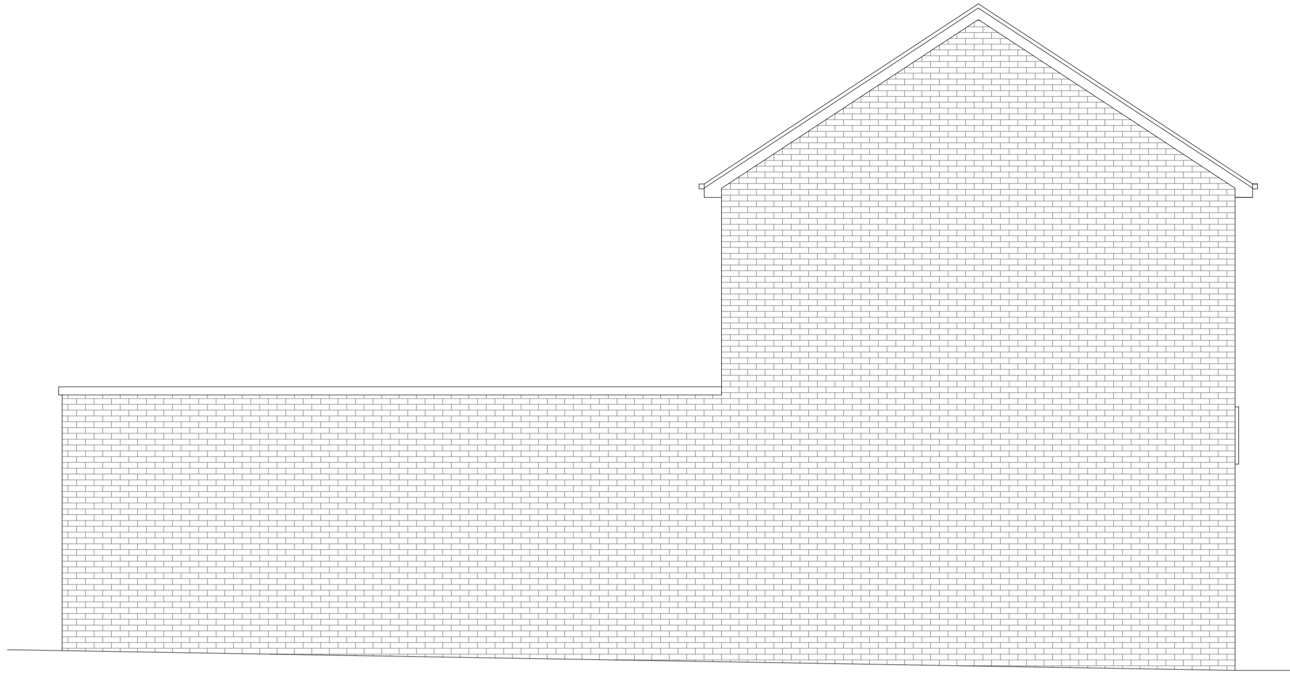
Existing Side Elevation- 1:50