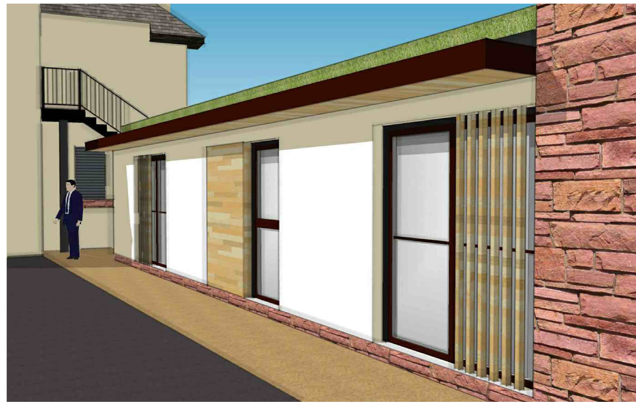
Lothian St Elevation (3)

This copy has been made by or with the authority of Midlothian Council pursuant to Section 47 of the Designs and Patents Act 1988. Unless that Act provides a relevant exception to copyright, the copy must not be copied without the prior permission of the copyright owner.