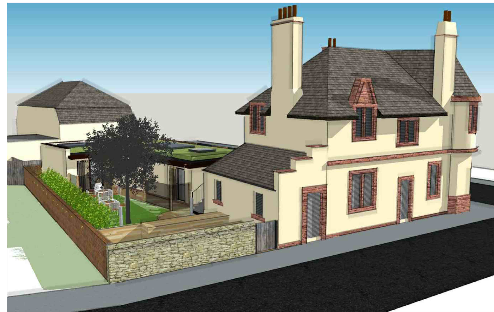
Douglas Cresc Elevation