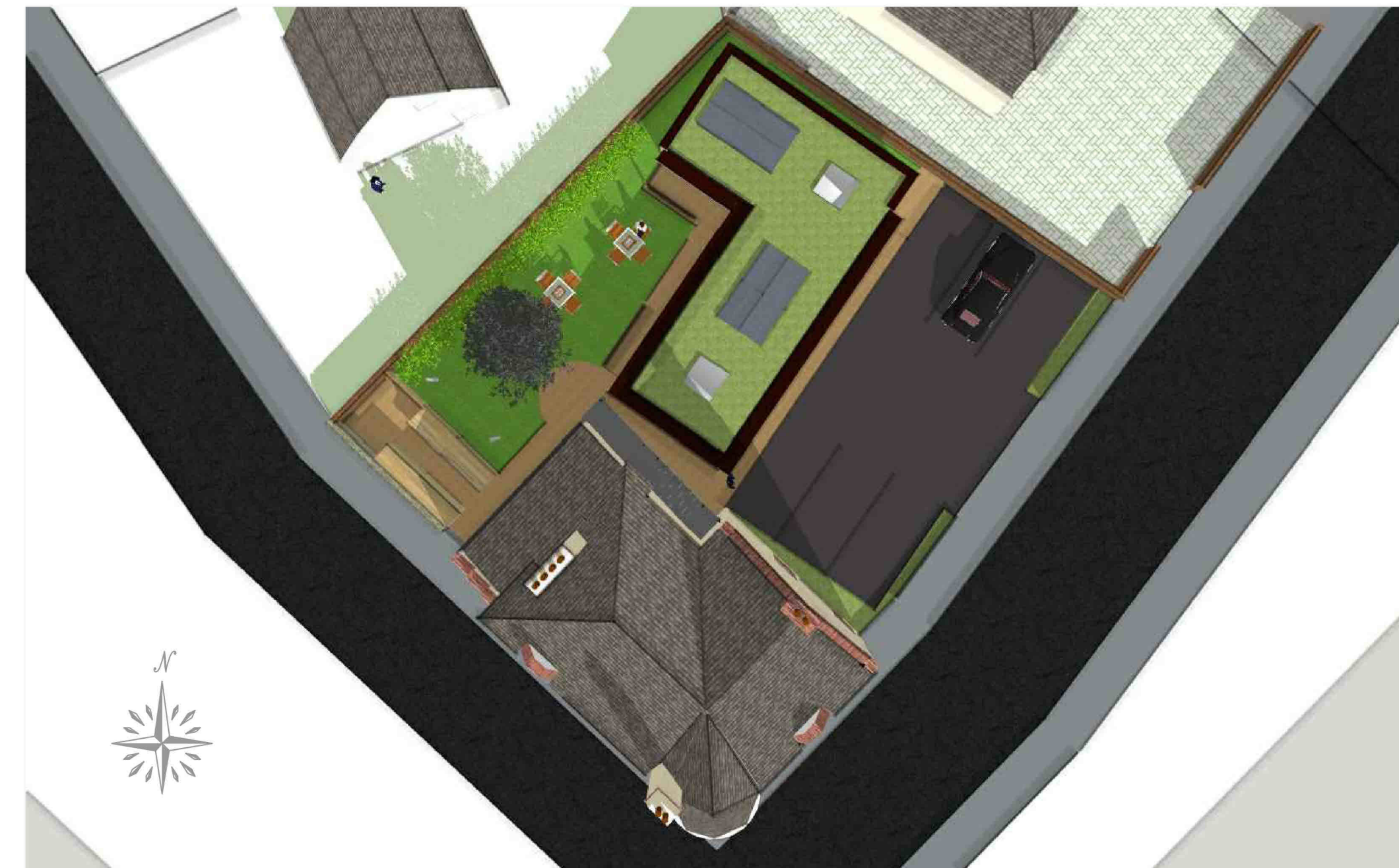
Aerial Site Plan View

© This drawing is copyright of Lothian Built Environment Services and must not be reproduced in whole or part without prior written permission. This drawing must not be scaled for construction purposes.