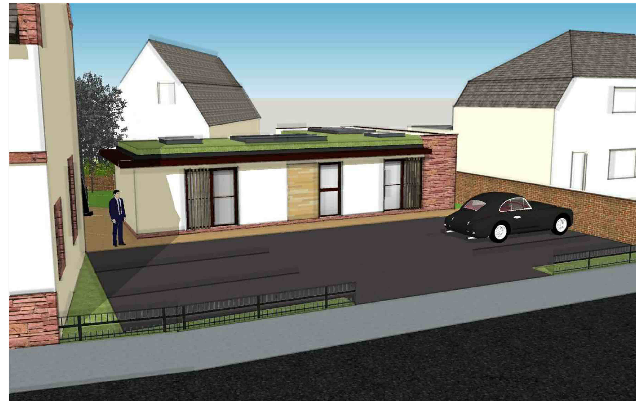
Lothian St Elevation (2)

This copy has been made by or with the authority of Midlothian Council pursuant to Section 47 of the Designs and Patents Act 1988. Unless that Act provides a relevant exception to copyright, the copy must not be copied without the prior permission of the copyright owner.