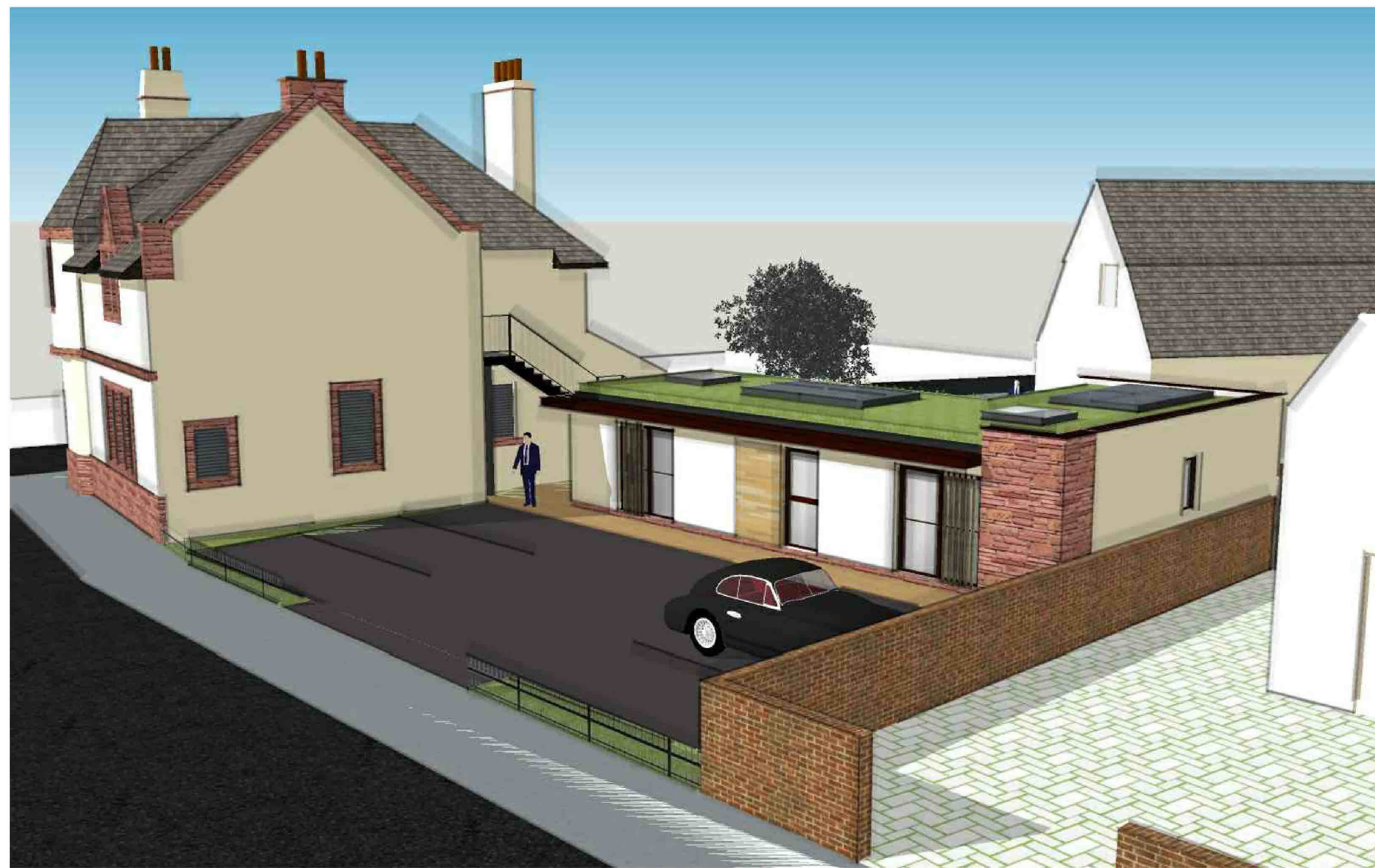
Lothian St Elevation (1)