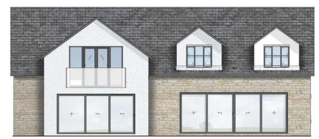
Item No - 4 Name - Plot 2 Proposed South Elevation Scale - 1 : 100