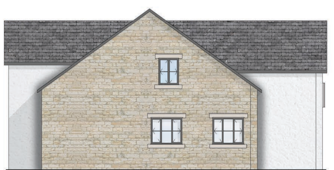
Item No - 5 Name - Plot 2 Proposed West Elevation Scale - 1 : 100