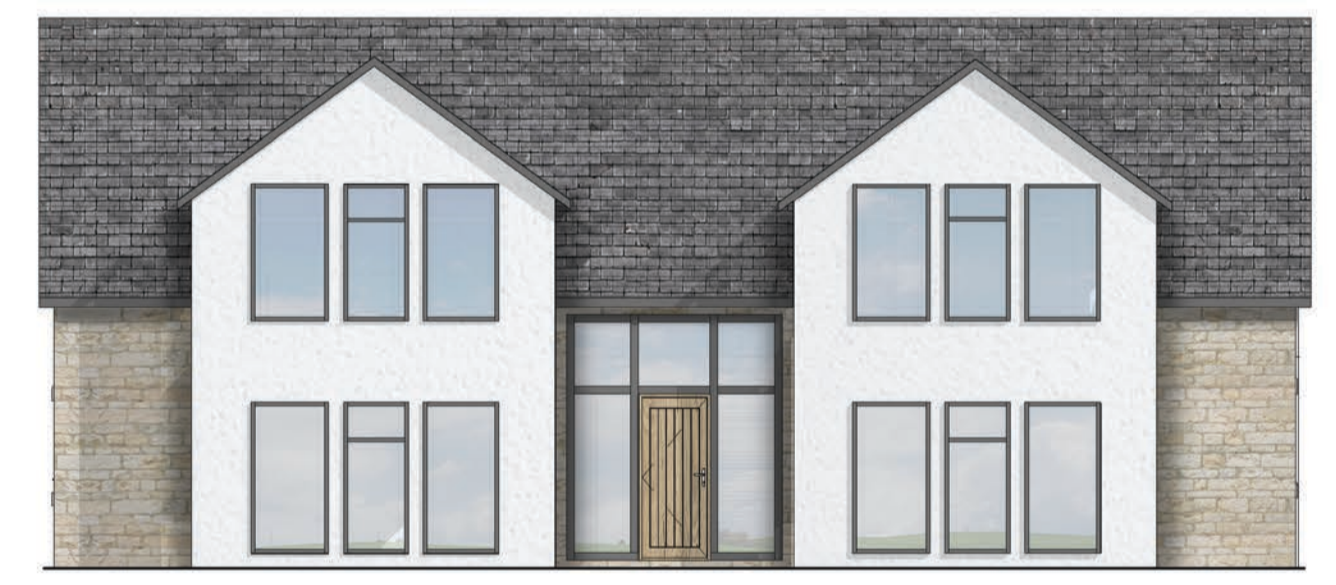
Item No - 2 Name - Plot 2 Proposed North Elevation Scale - 1 : 100