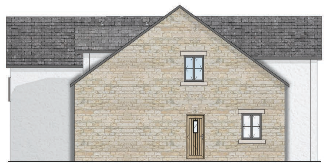
Item No - 3 Name - Plot 2 Proposed East Elevation Scale - 1 : 100