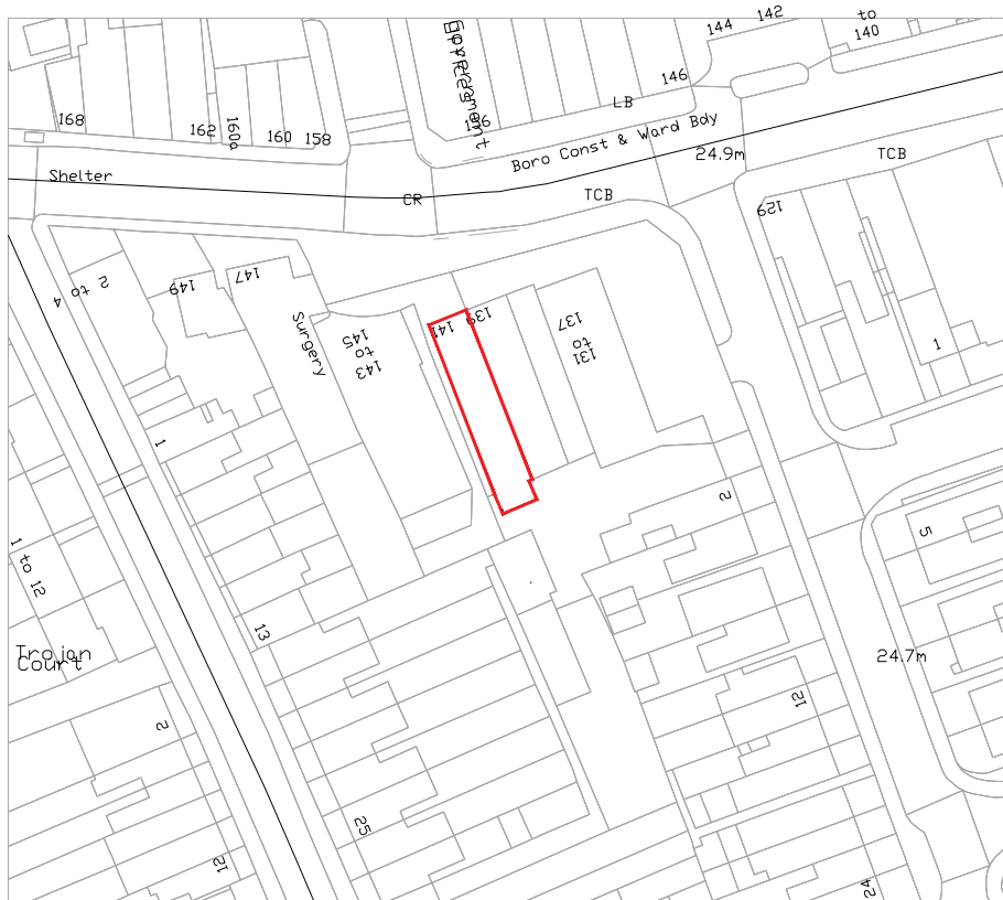
Site location plan 1:1250

This drawing is protected under Copyright and at no time should any portion of this drawing be reproduced or copied without the permission of the Architect. (Design Copyright Act 1968) This drawings must not be used for purposes other than that for which it is provided. It is supplied without liability for any errors or omissions. Drawings only to be scaled for planning application purposes, all dimensions to be checked on site. All drawings subject to Statutory Authority Approval.