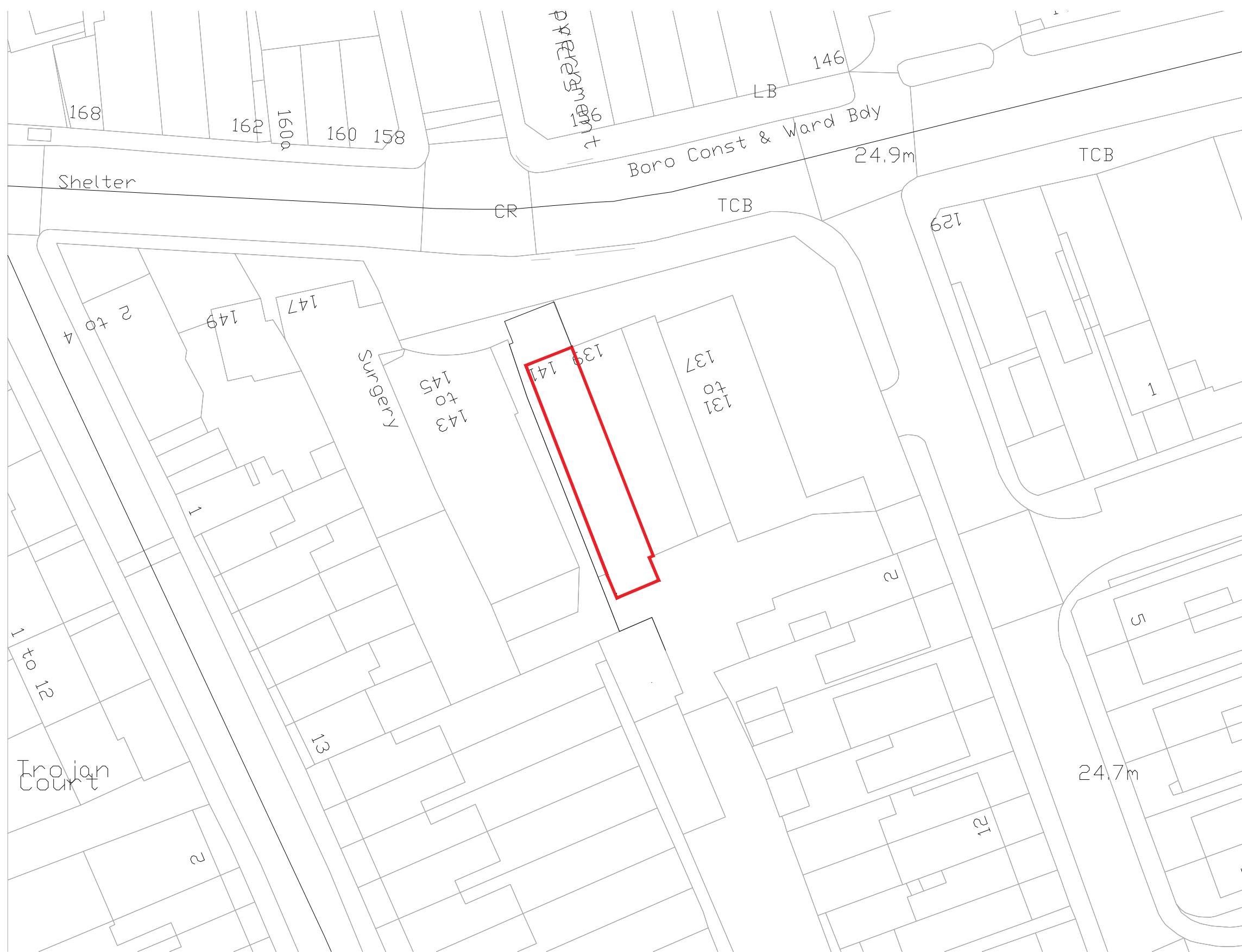
Existing / Proposed Site Block plan 1:500

This drawing is protected under Copyright and at no time should any portion of this drawing be reproduced or copied without the permission of the Architect. (Design Copyright Act 1968) This drawings must not be used for purposes other than that for which it is provided. It is supplied without liability for any errors or omissions. Drawings only to be scaled for planning application purposes, all dimensions to be checked on site. All drawings subject to Statutory Authority Approval.