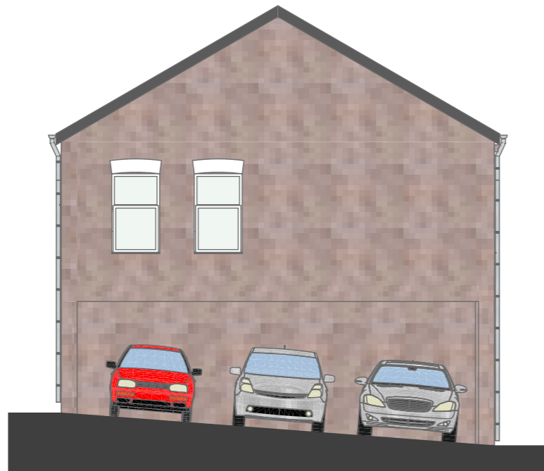
E-03 South Facing Elevation 1:100