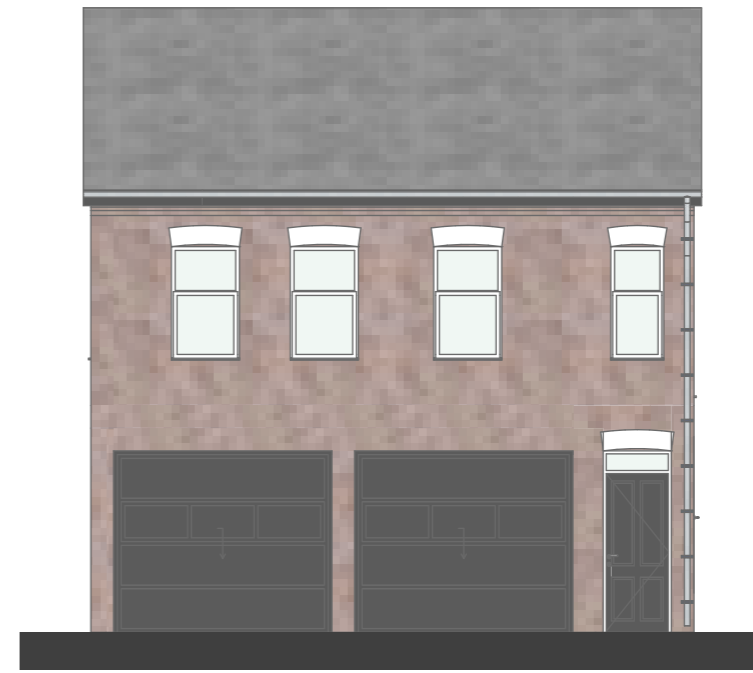
E-02 East Facing Elevation 1:100