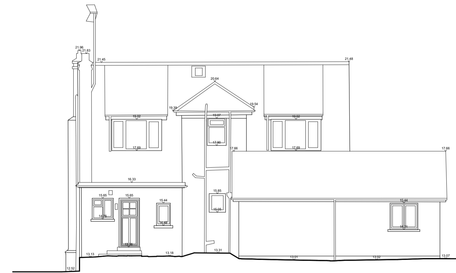
4 West Elevation - Existing 1 : 100