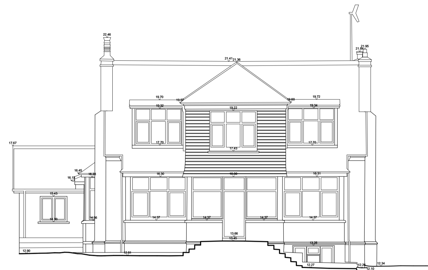
1 East Elevation - Existing 1 : 100