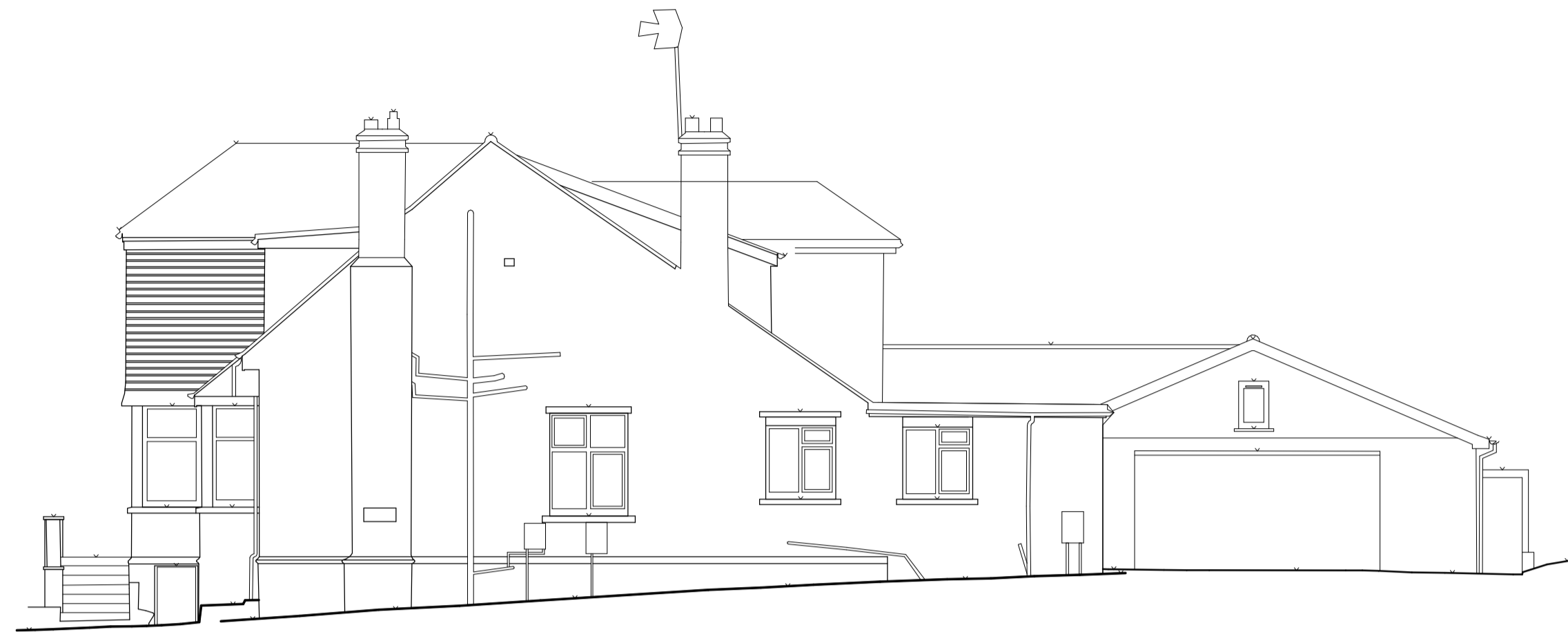
2 North Elevation - Existing 1 : 100