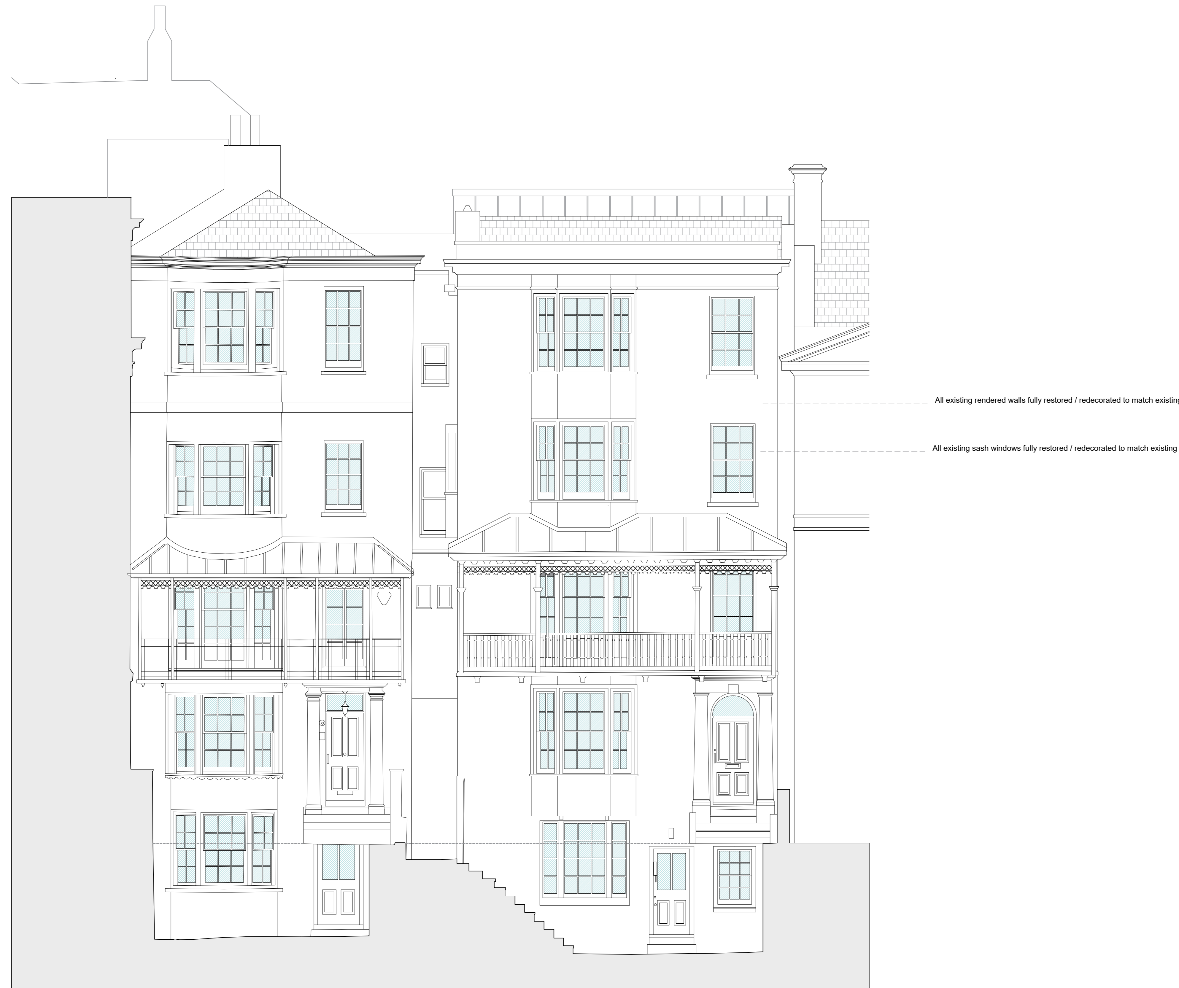
No 52 / 53 - East Elevation Proposed - 1:50@A1

notes Please note: These are planning application stage drawings not construction drawings and should be treated as such.