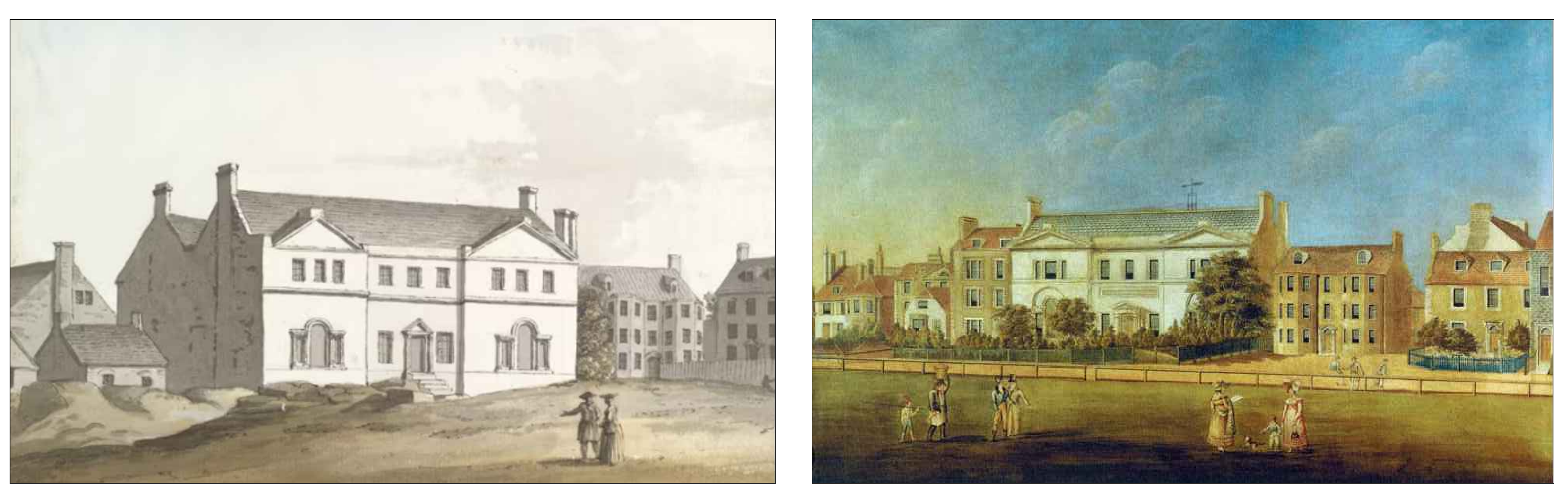
Marlborough House - Illustation 1787 - Samuel Hieronymus Grimms - Prior to construction of immediately adjacent Numbers 52--53 Old Stein.