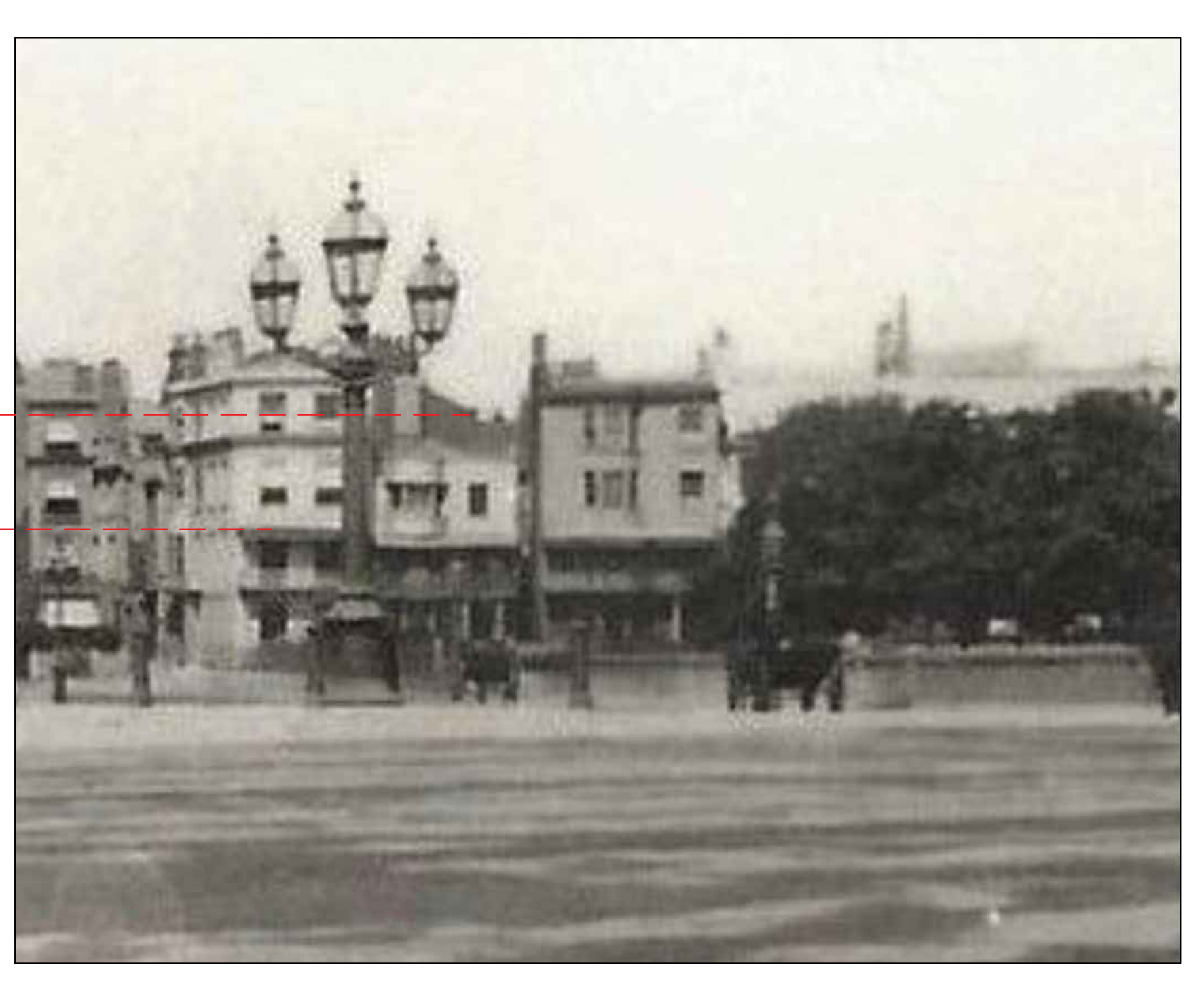
1890 Photo - Please Note No 52 is 1 storey shorter so top floor is late 19th century / early 20th century addition.