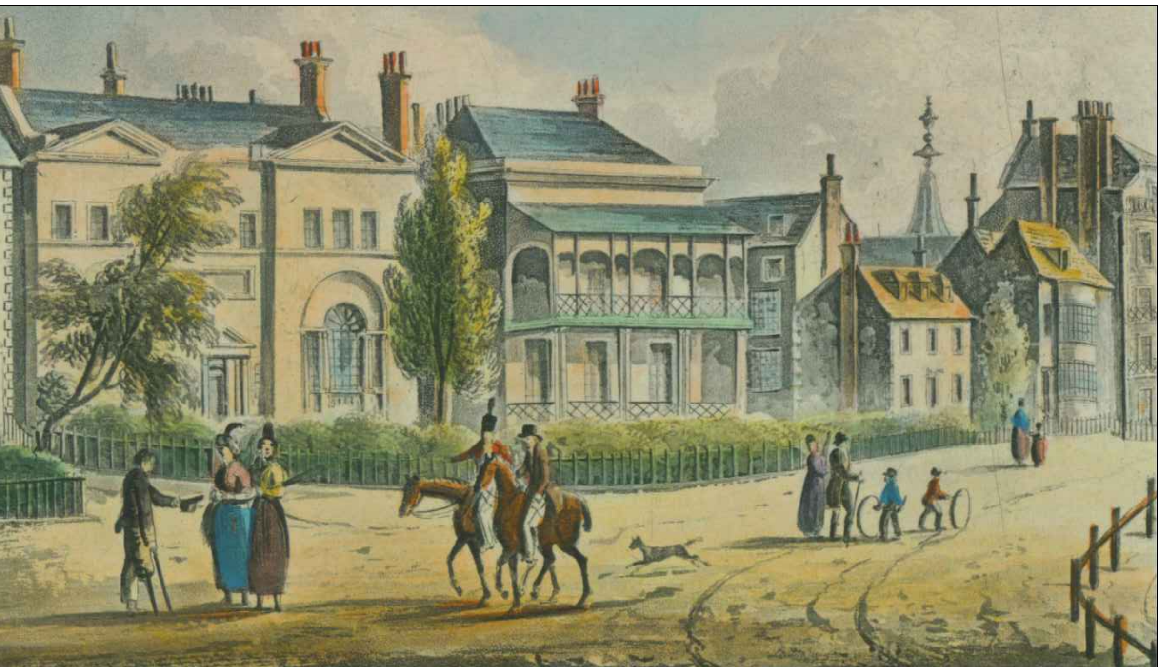
Marlborough House - Illustation 1810 - Miss Fitzherbert's House Next To Marlborough House / corner of Number 53 (to Storey Shorter) also part Visible prior to early / Mid Victorian upgrade and adaption.