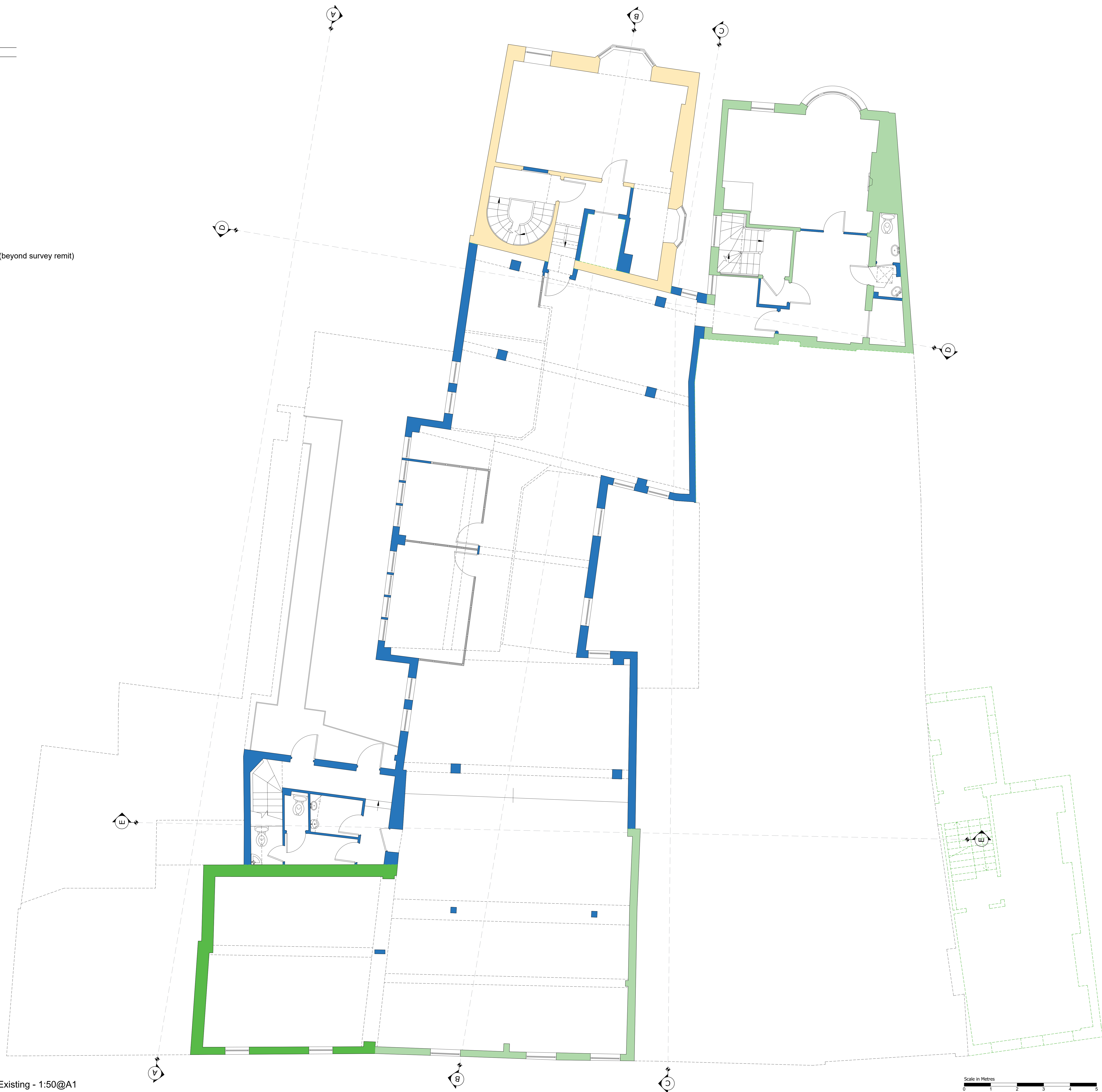
Second Floor Plan - Existing - 1:50@A1

REV B - General design updates 24/01/30 REV A - Consultant input updates 23/12/15