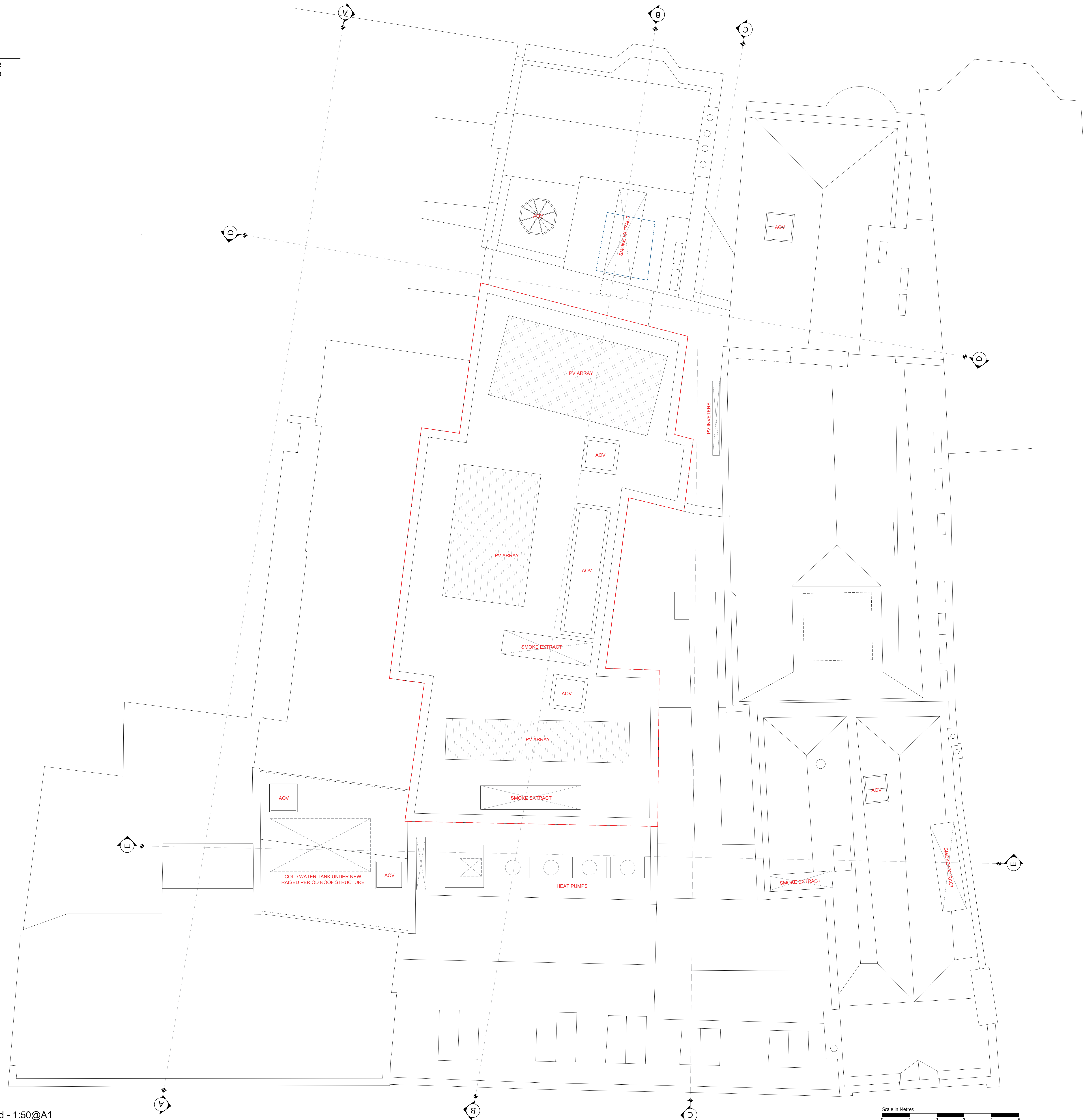
Roof Plan - Proposed - 1:50@A1