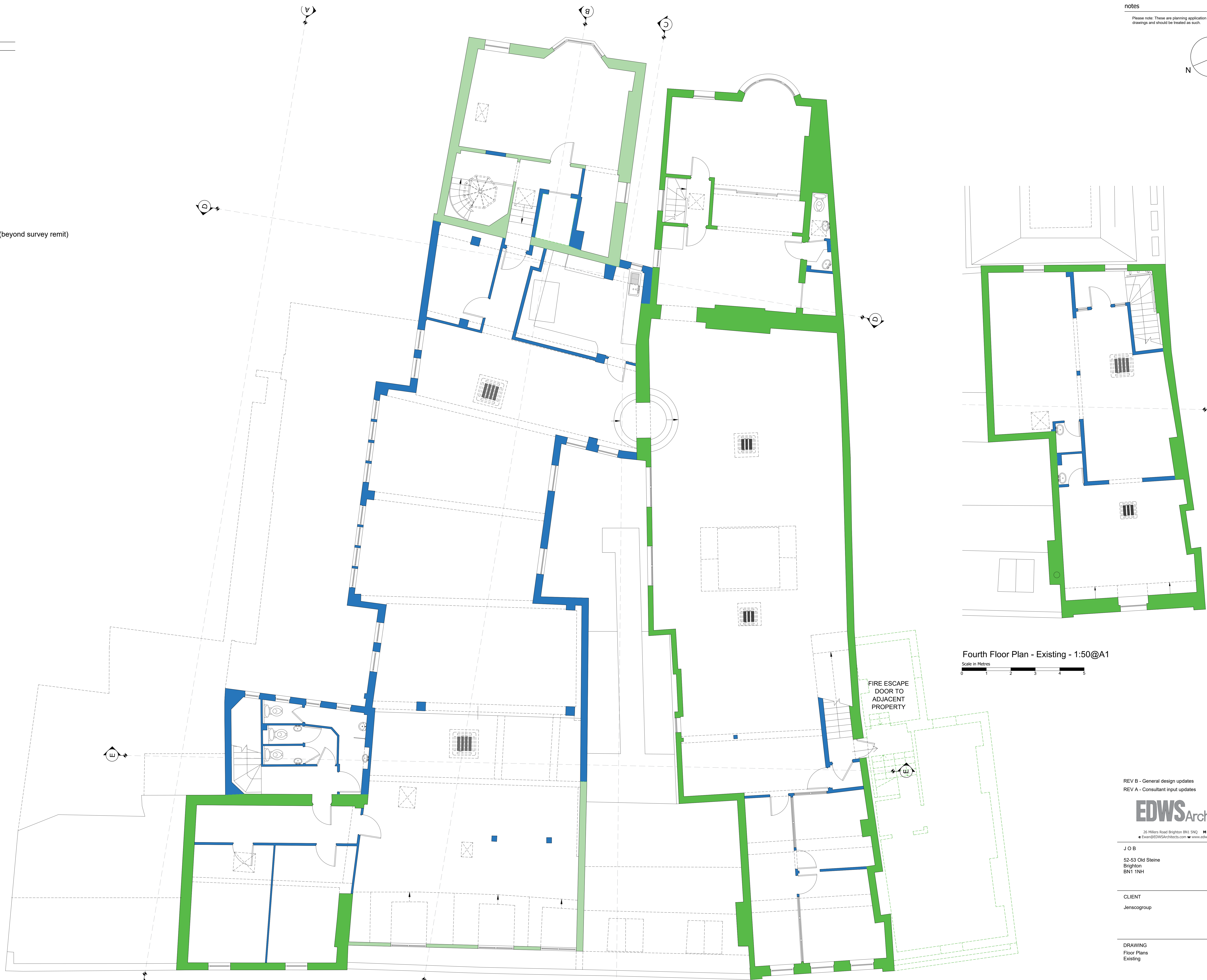
Fourth Floor Plan - Existing - 1:50@A1