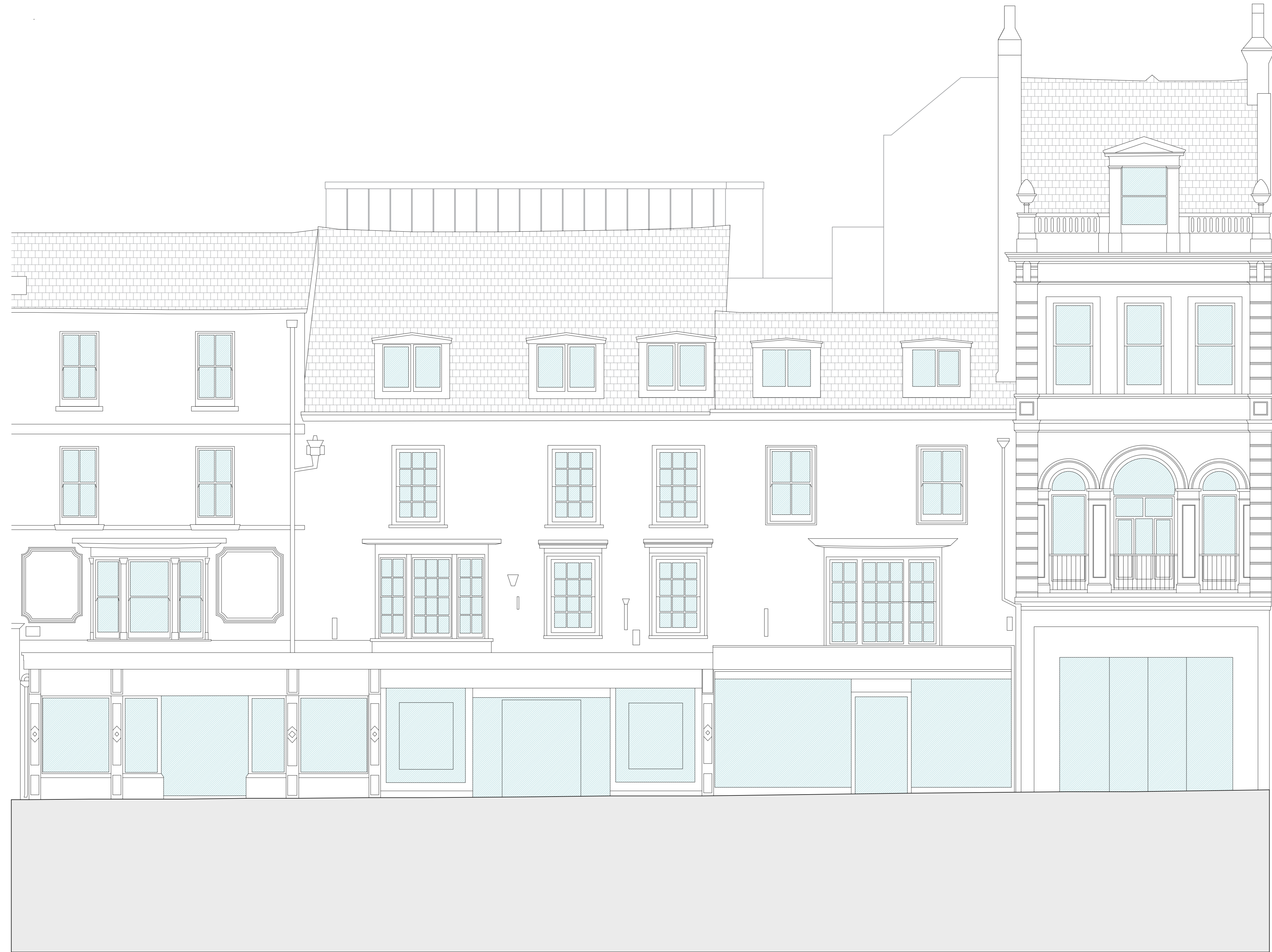
West Elevation Proposed - 1:50@A1

notes Please note: These are planning application stage drawings not construction drawings and should be treated as such.