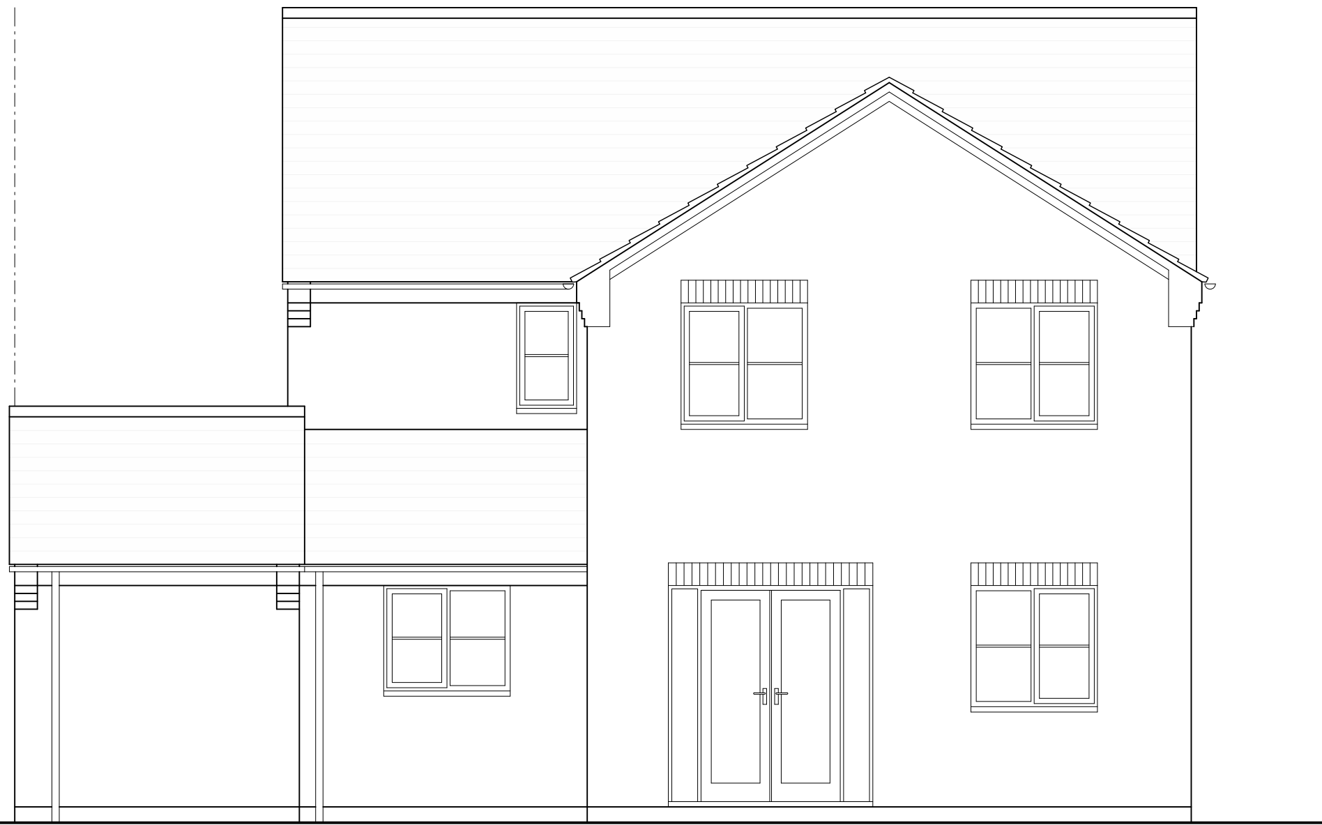
REAR ELEVATION AS EXISTING | Scale 1:50