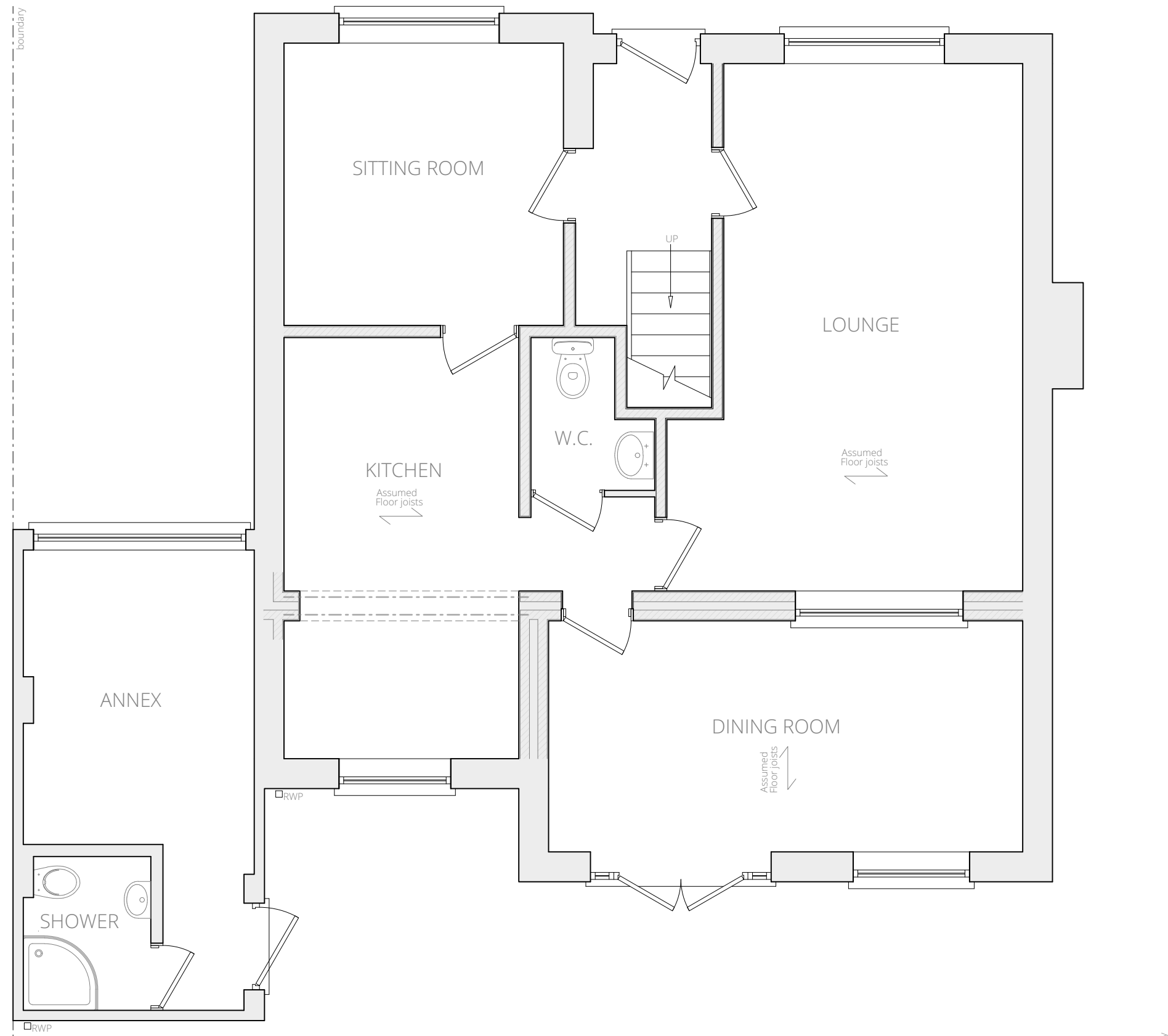
GROUND FLOOR PLAN AS EXISTING | Scale 1:50