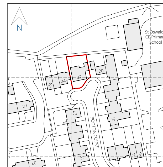
LOCATION PLAN AS EXISTING | Scale 1:1250

© This drawing and the design depicted in it are the copyright of the designer and may not be reproduced except by written permission. Ordnance Survey © Crown Copyright 2024. All rights reserved. Licence number 100022432. This drawing is to establish a proposed design which is agreed by the client and then used for the purpose of obtaining a Planning Decision only. They are not to be used by the builder for site construction and specification guidance, until Building Control Approval is obtained. Engineering & Building Design Ltd will only act as Principle Designer if a full set of construction drawings and calculations have been provided by EBD Ltd and approved by Building Control and a signed agreement has been approved by the client. Otherwise The Principle Designer is to be undertaken by The Client or Builder.