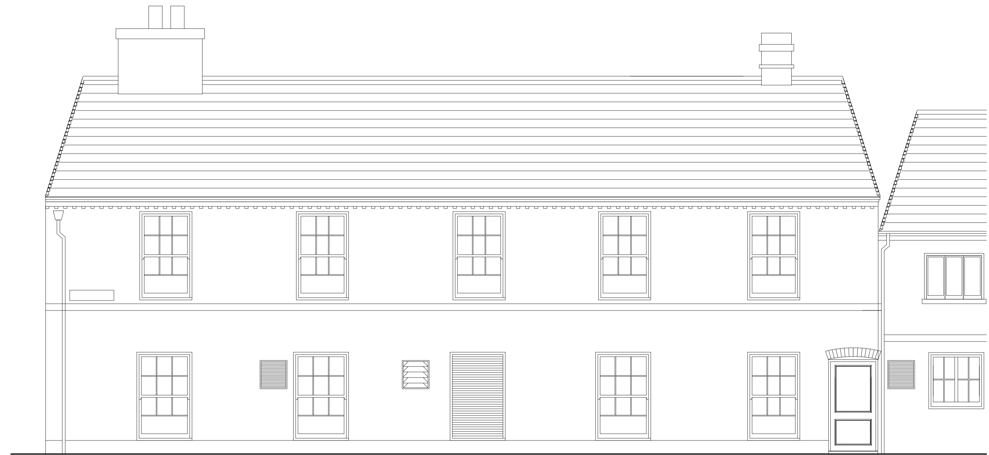
Existing side elevation (to Heath Road)