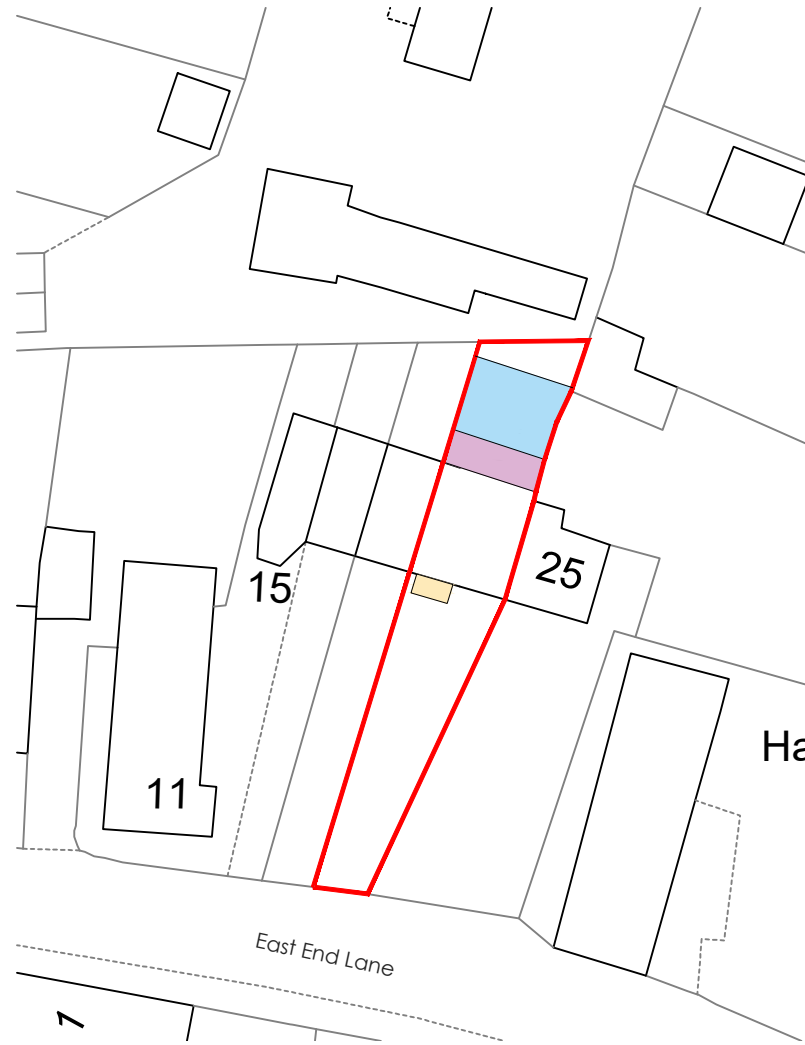
02 Block Plan 100 Scale: 1:500