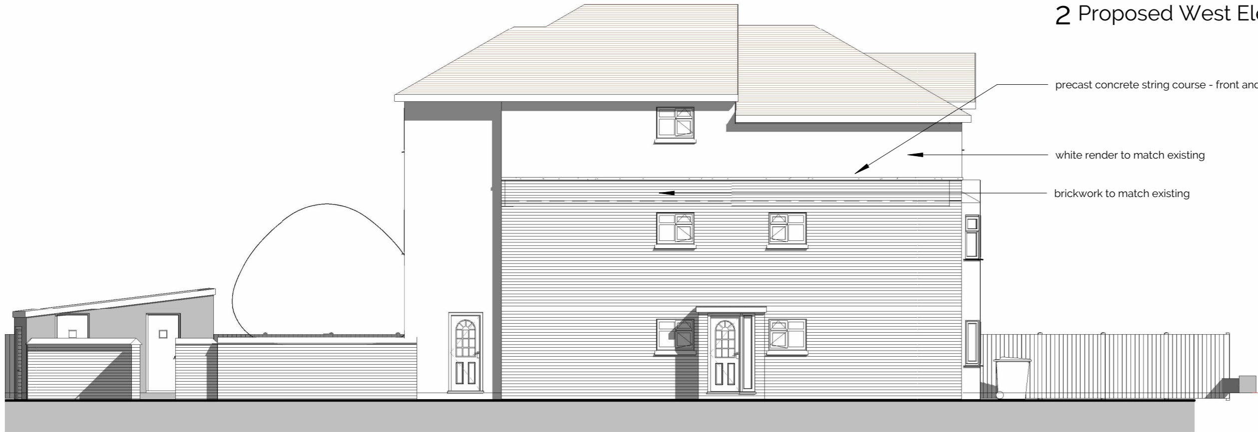
1 Proposed North Elevation to Garden 2 Proposed West Elevation to No.23