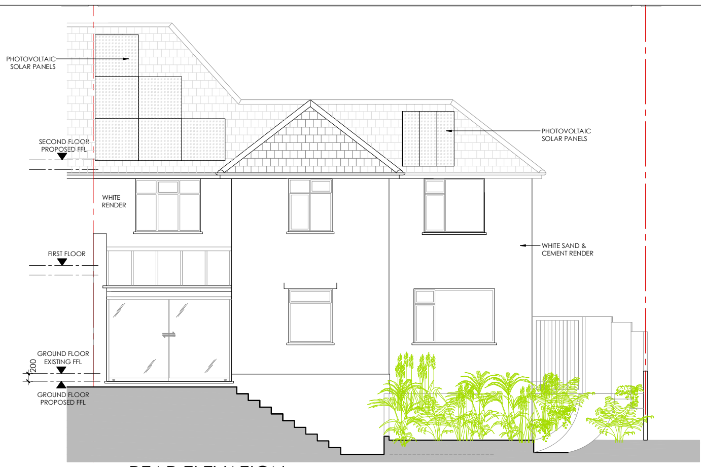
3 REAR ELEVATION PROPOSED