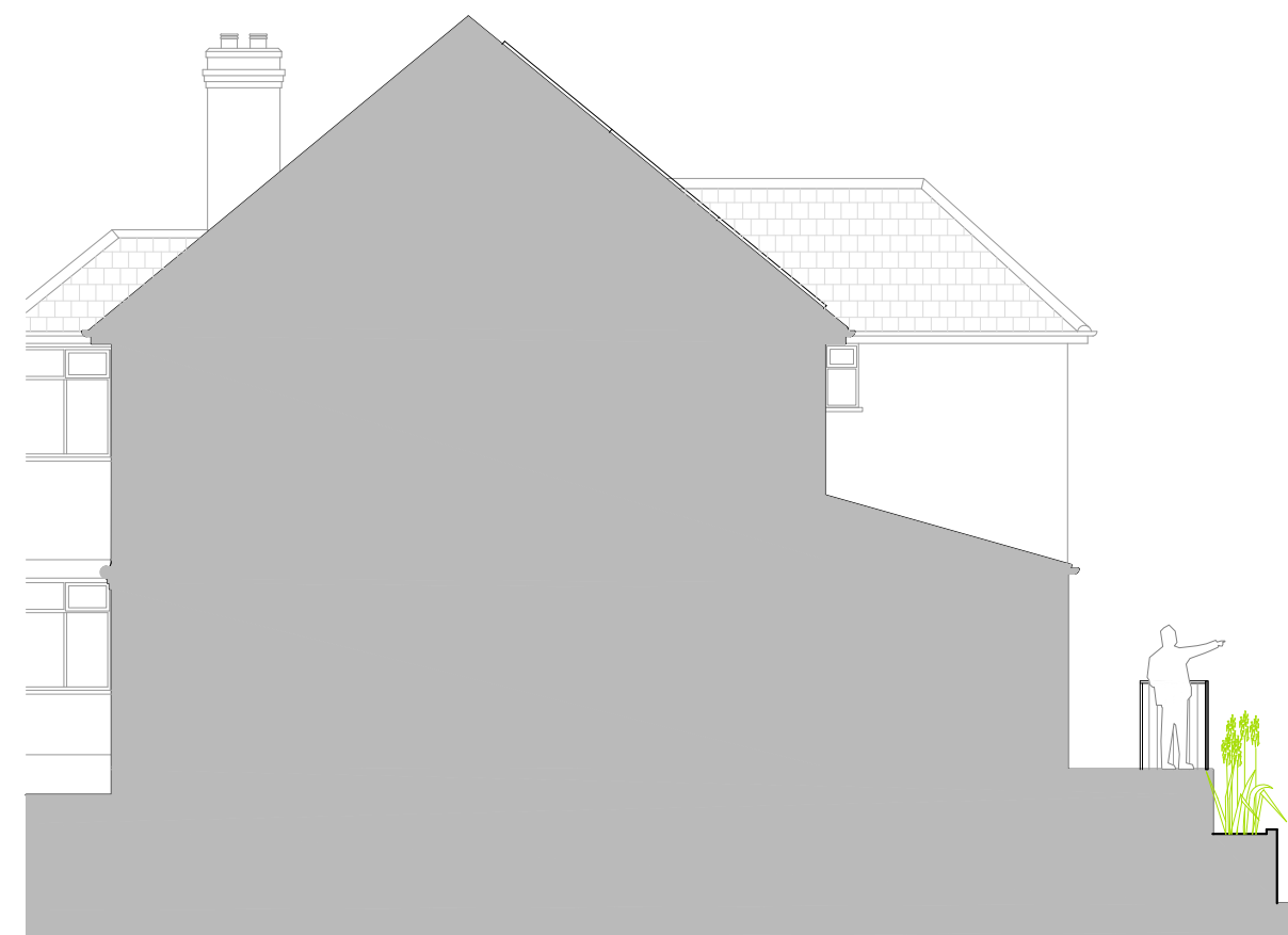
5 NORTH WEST ELEVATION PROPOSED

NOTE: THIS DRAWING IS PROPERTY OF IMAGE ARCHITECTURE LTD. AND IS NOT TO BE REPRODUCED IN HARD OR ELECTRONIC COPIES IN WHOLE OR IN PART WITHOUT A PRIOR PERMISSION. DRAWINGS ARE FOR PLANNING PURPOSES ONLY AND SHOULD NOT BE USED FOR CONSTRUCTION. WHEN DRAWING PRINTED OF PDF USE SCALE BAR RATHER THAN SCALE RULER TO CHECK DIMENSIONS.