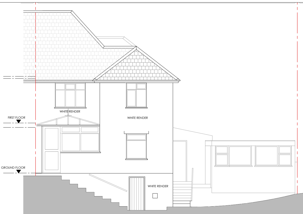
2 REAR ELEVATION - EXISTING 1:100