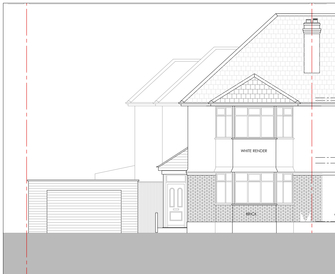
1 FRONT ELEVATION - EXISTING 1:100

NOTE THIS DRAWING IS PROPERTY OF IMAGE ARCHITECTURE LTD. AND IS NOT TO BE REPRODUCED IN HARD OR ELECTRONIC COPIES IN WHOLE OR IN PART WITHOUT A PRIOR PERMISSION. DRAWINGS ARE FOR PLANNING PURPOSES ONLY AND SHOULD NOT BE USED FOR CONSTRUCTION. WHEN DRAWING PRINTED OF PDF USE SCALE BAR RATHER THAN SCALE RULER TO CHECK DIMENSIONS.