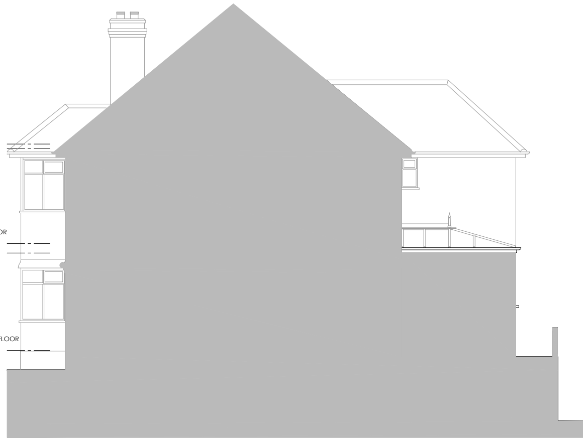
4 NORTH WEST ELEVATION - EXISTING 1:100