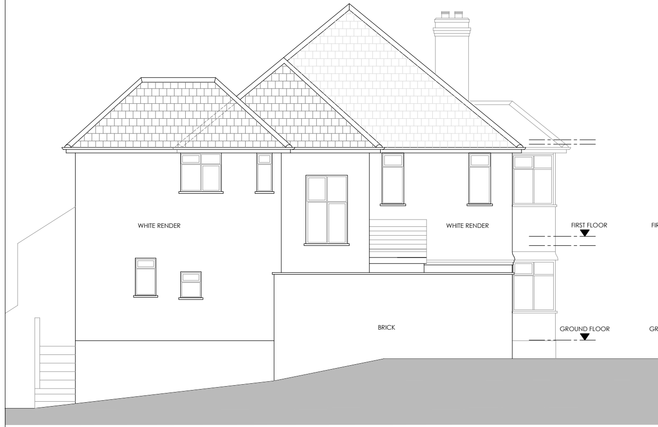
3 SOUTH EAST ELEVATION - EXISTING 1:100