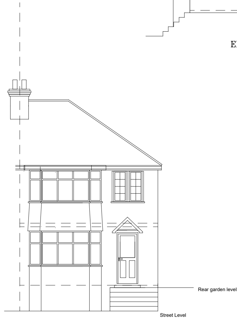
EXISTING FRONT ELEVATION 1:100