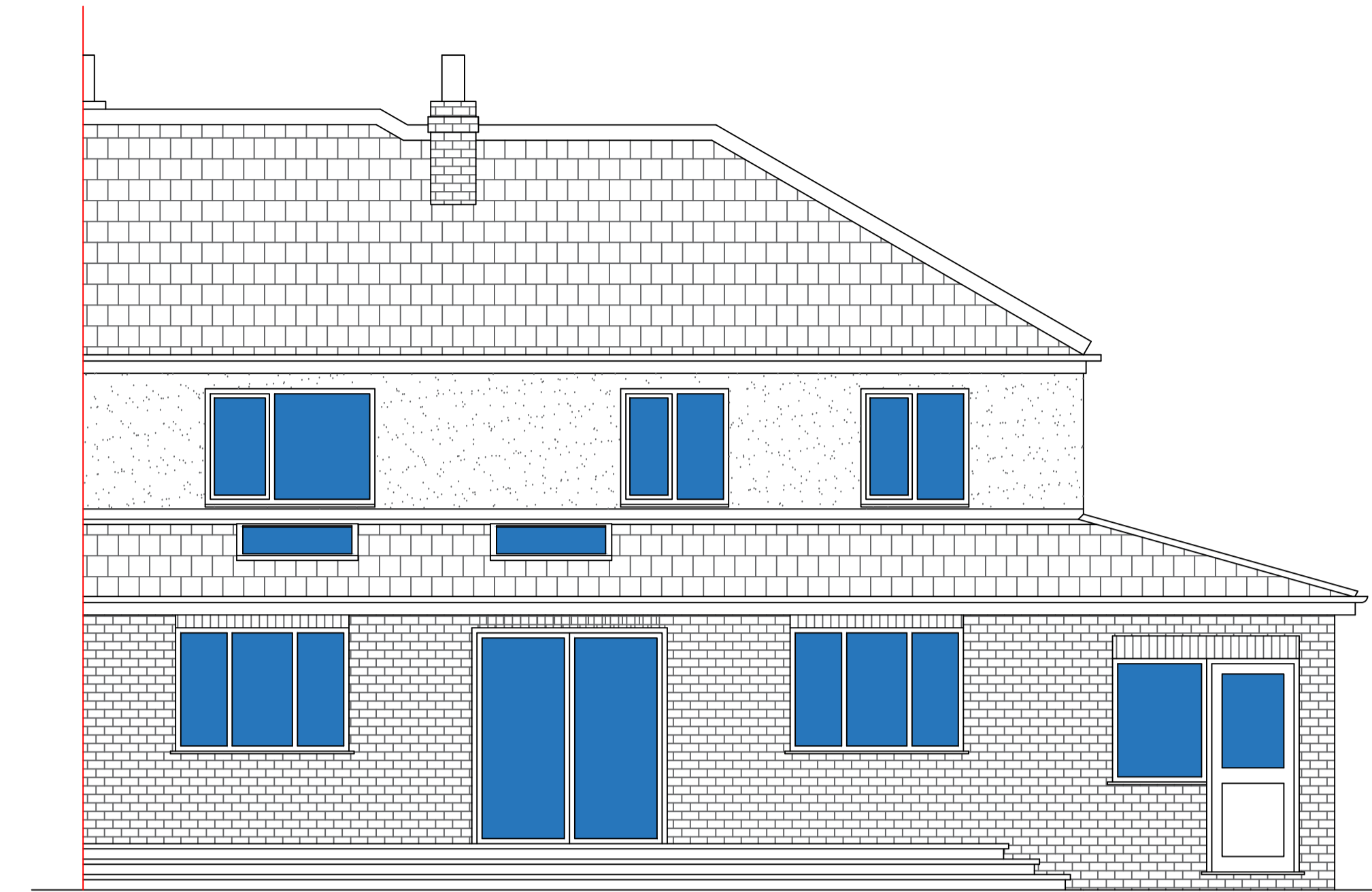
Rear Elevation 1:50