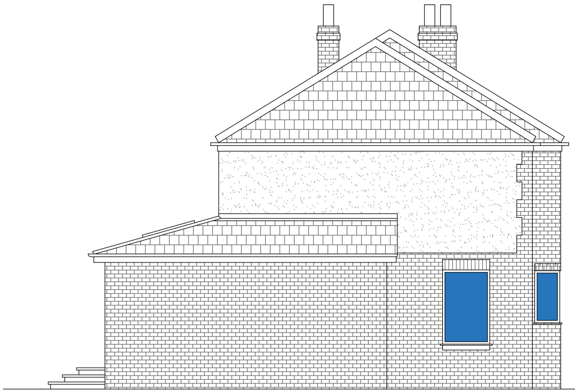
Side Elevation 1:50