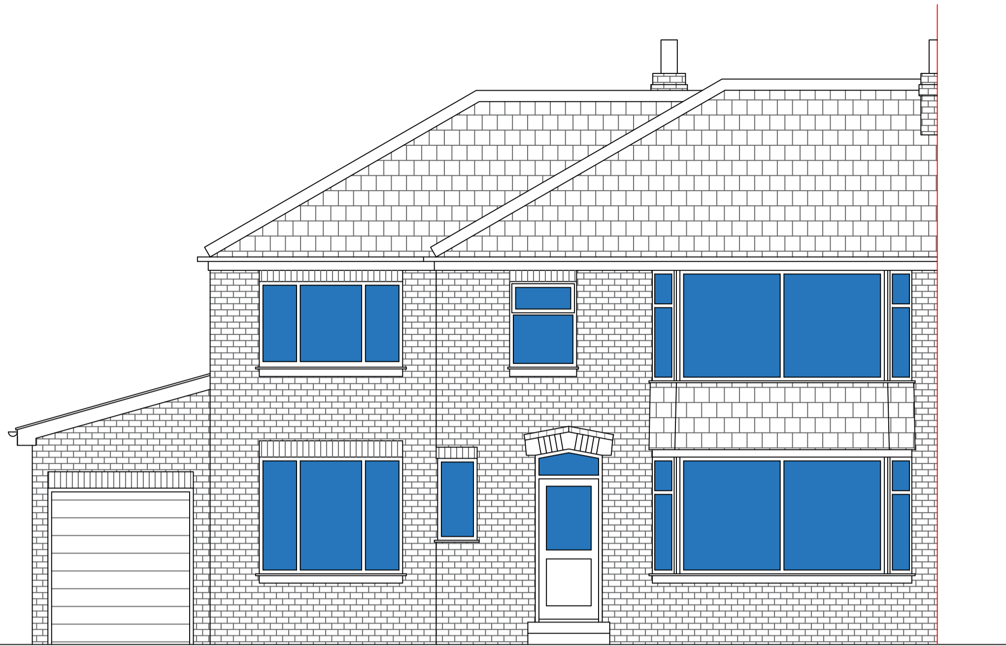
Front Elevation 1:50