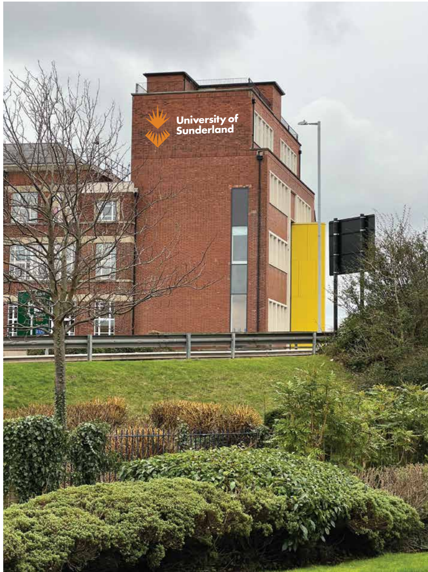
In situ approximation

approx 14 mtrs from ground level to underside of spark logo