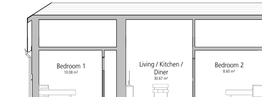
Proposed Section C-C