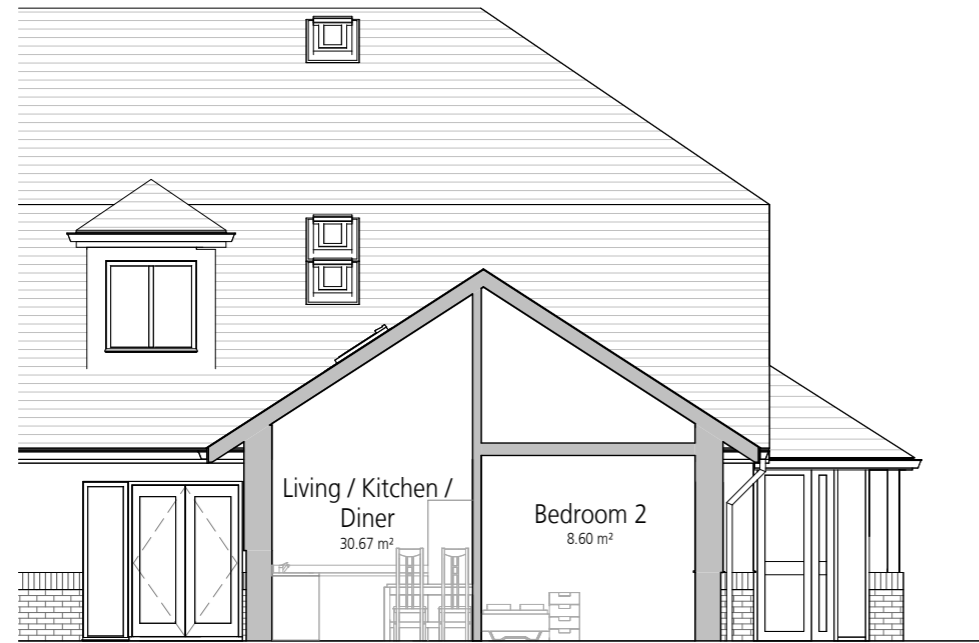
Proposed Section A-A