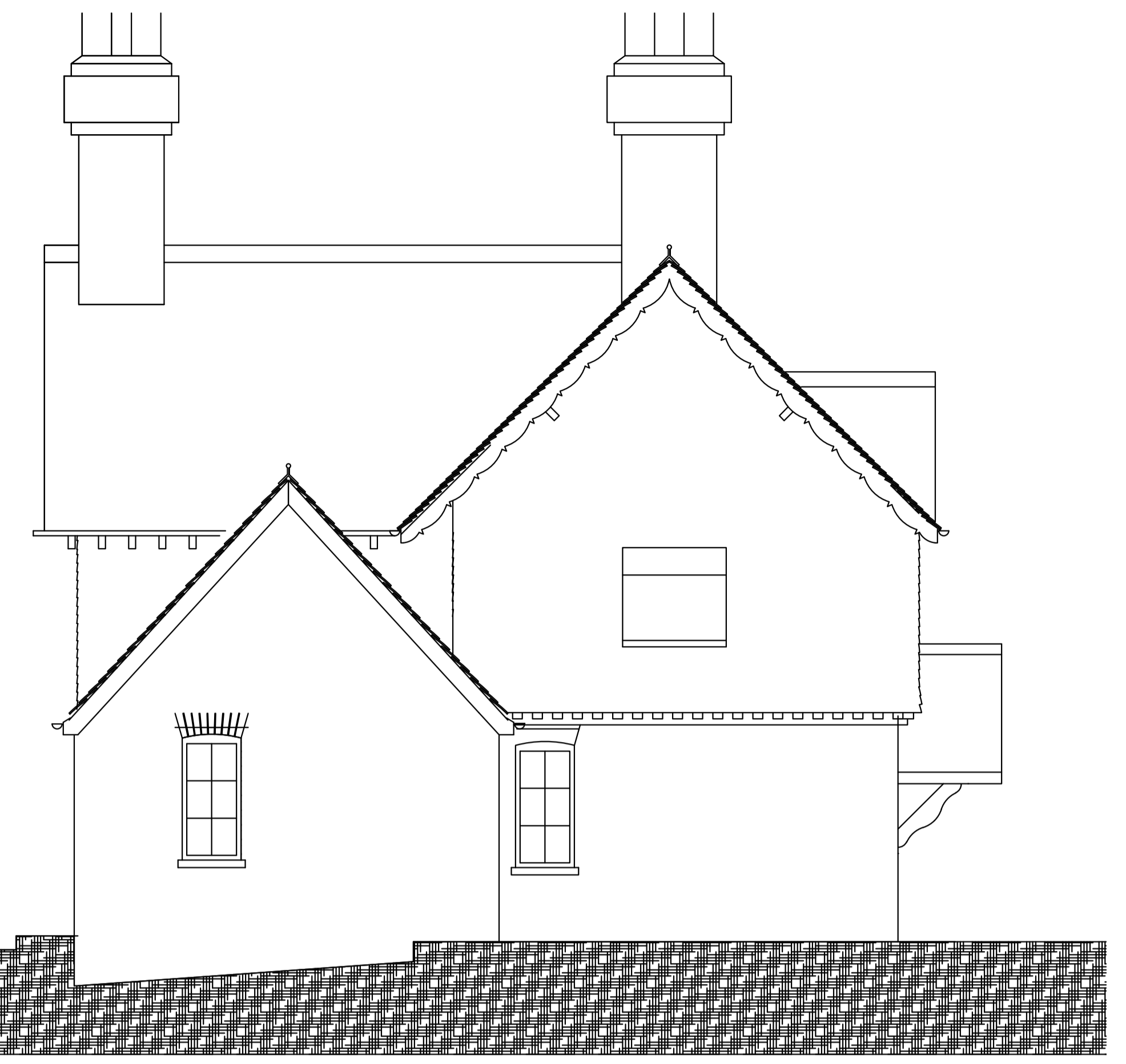
Existing Side Elevation 1:50 @A1