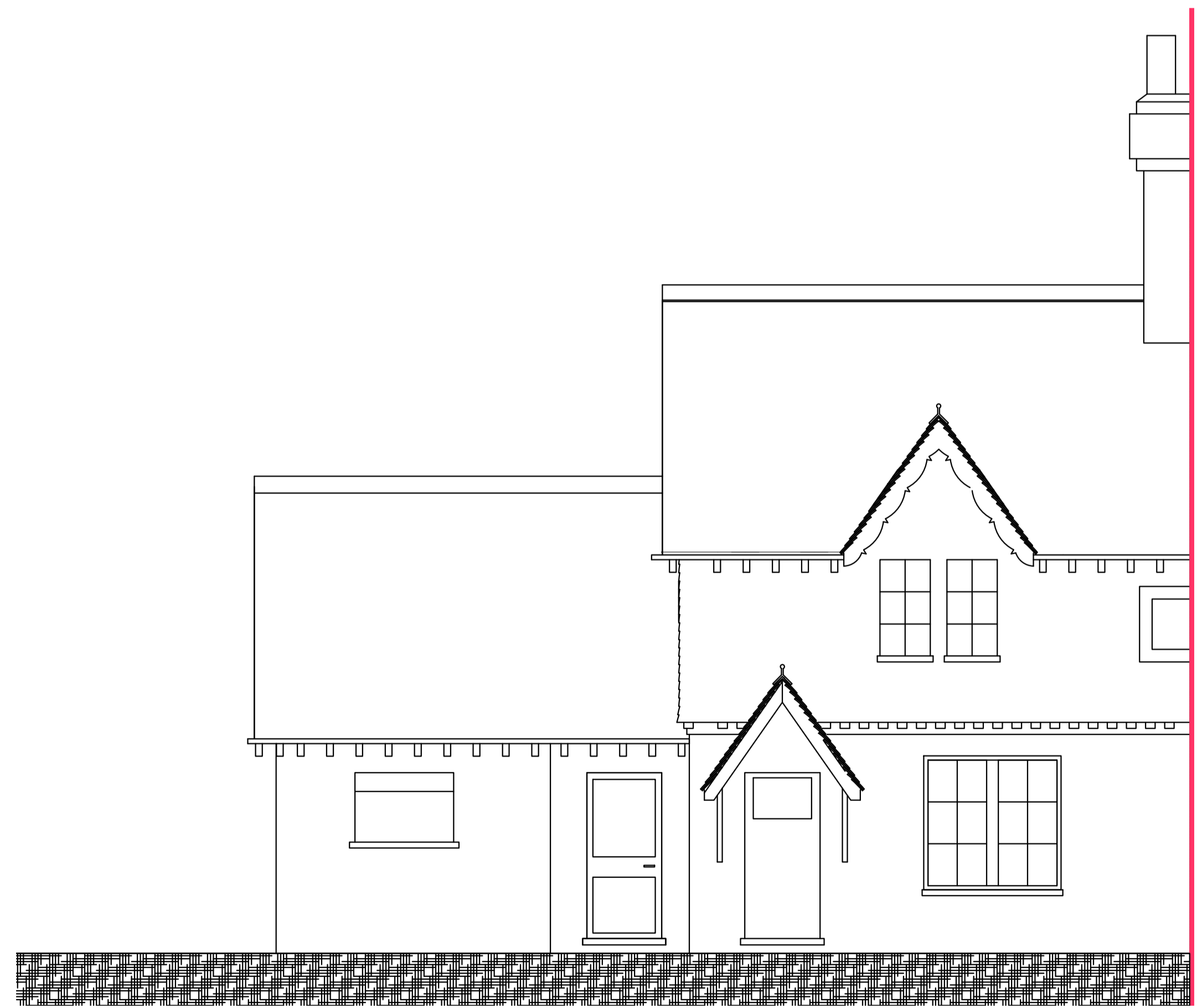
Existing Front Elevation 1:50 @A1