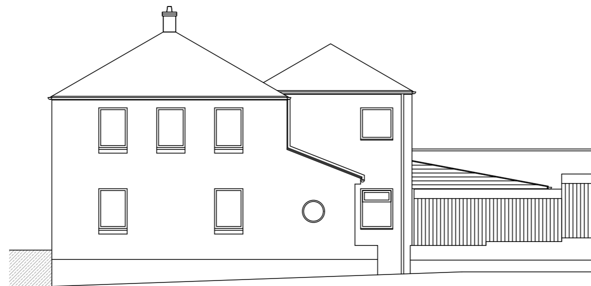
Existing Road Elevation