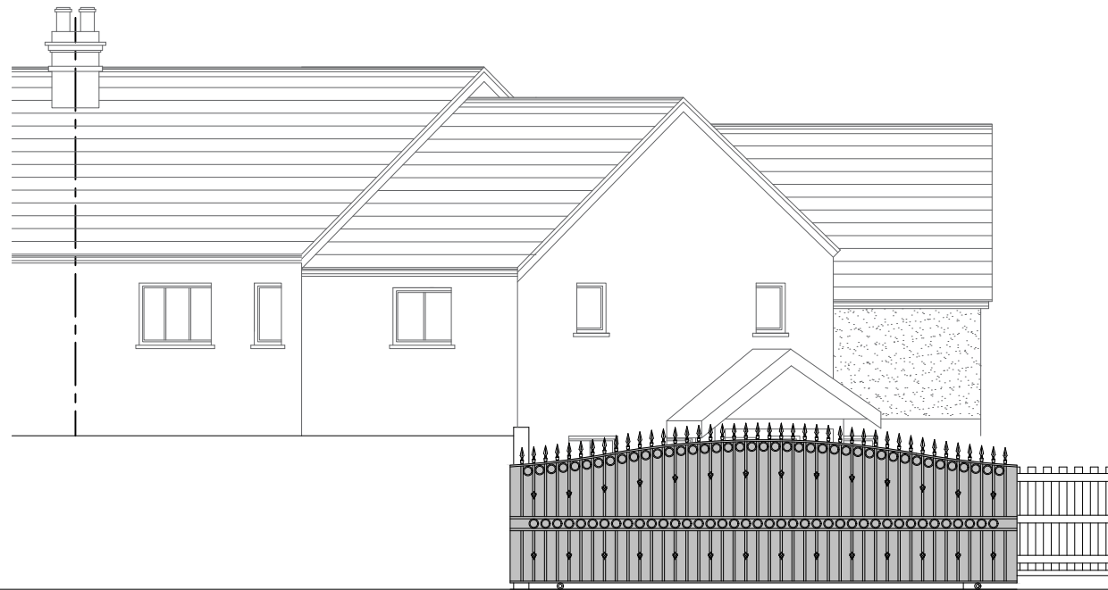
Existing Gate Front Elevation