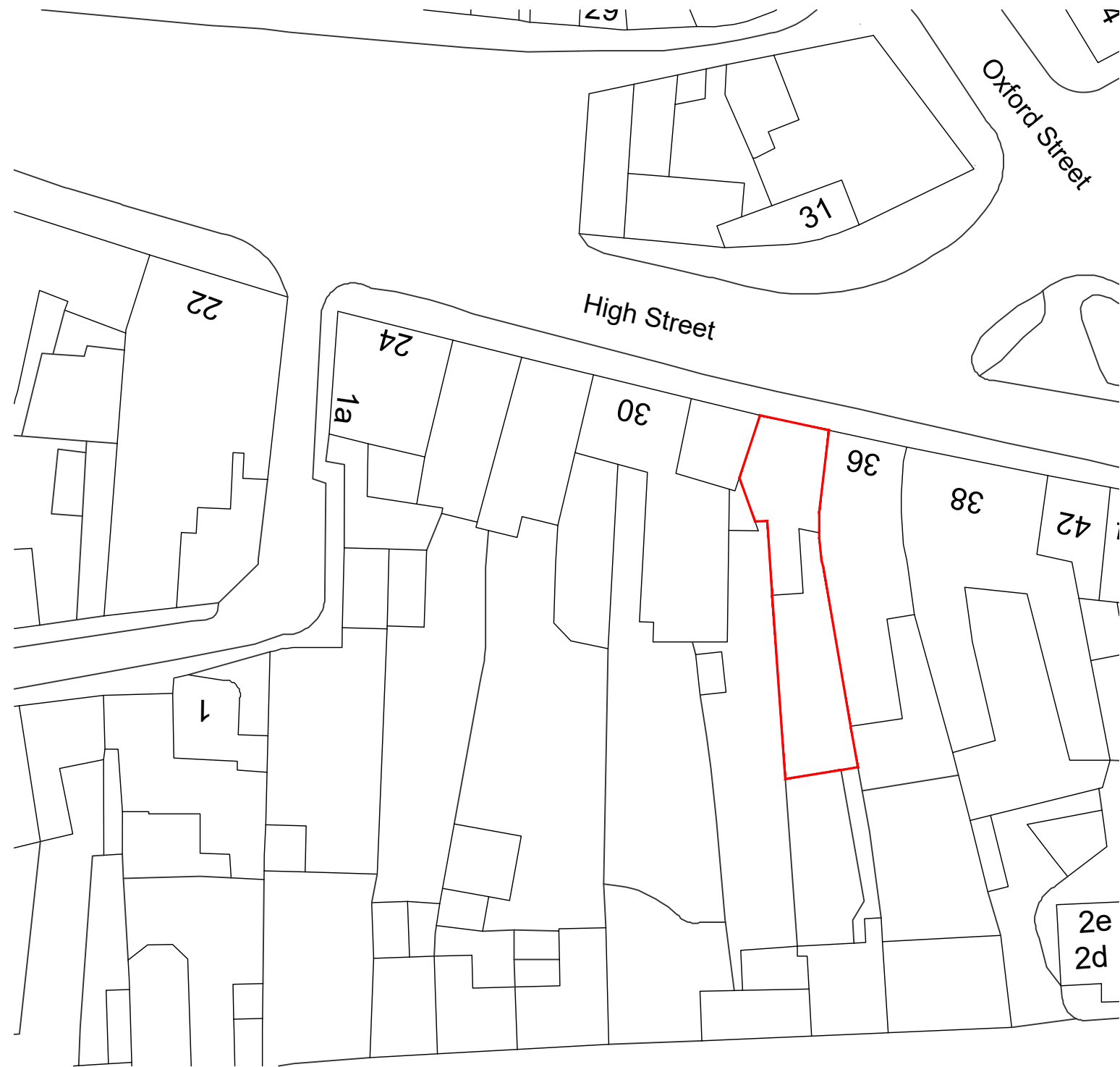
Existing Block Plan E_1:500