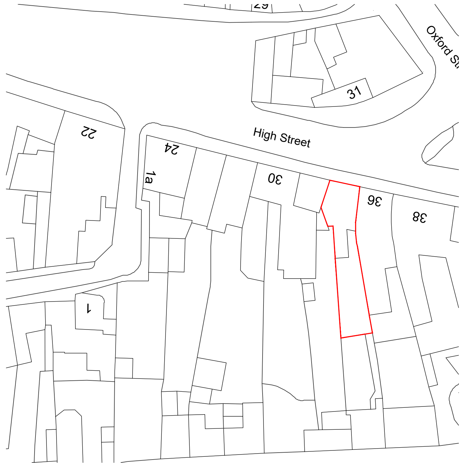
Existing Block Plan E_1:500