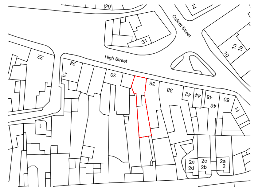
Location Plan E_1:1250