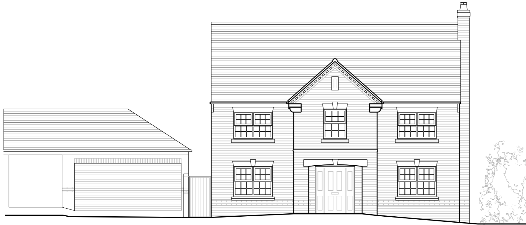
Proposed East Elevation Front Elevation (No proposed changes)