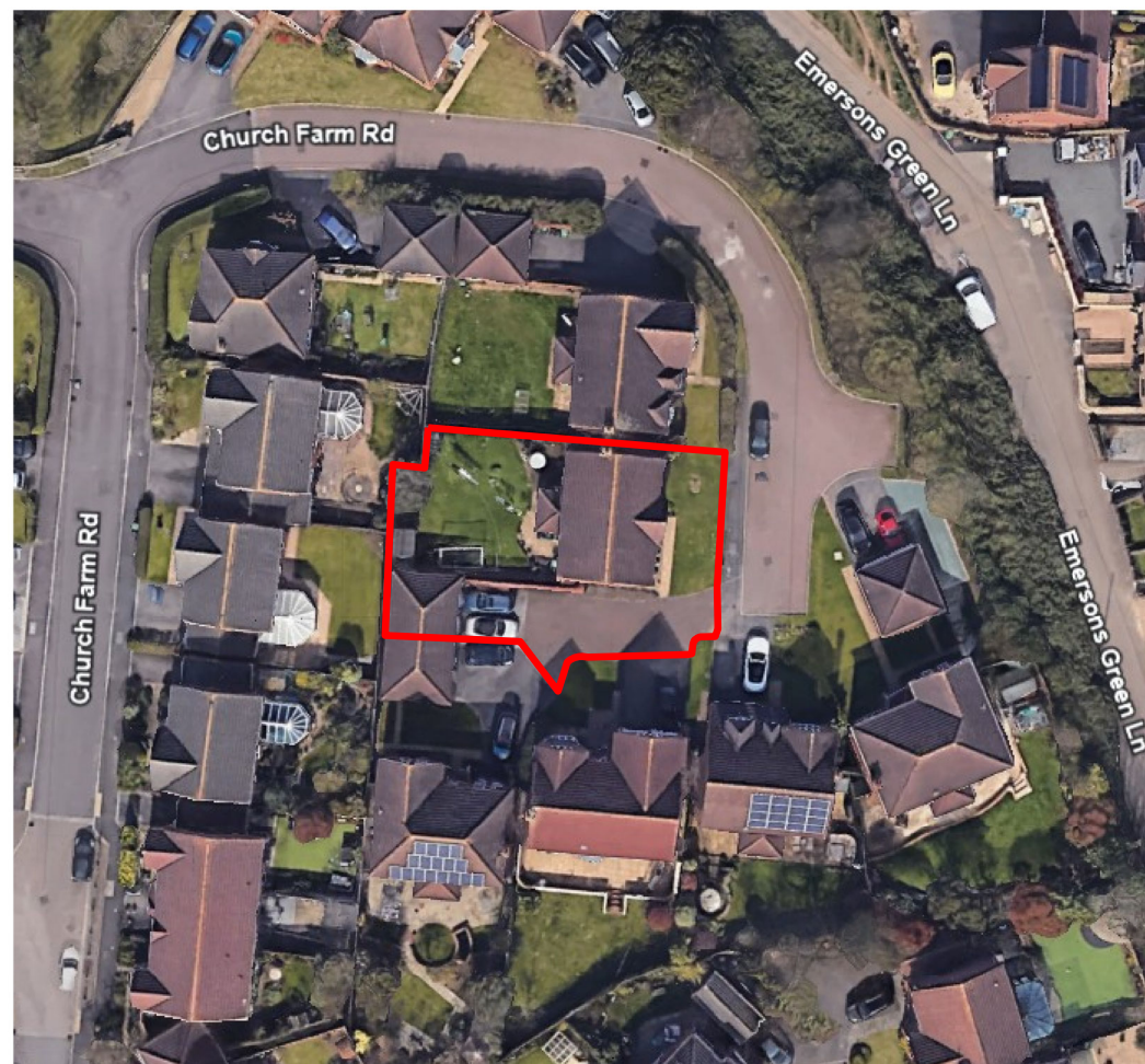
Aerial View Not to Scale