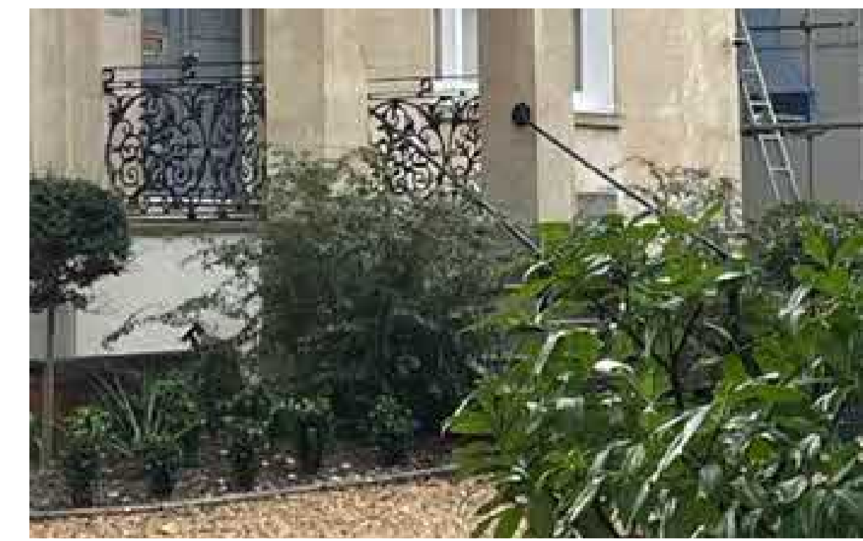
Precedent images of painted iron balustrade.