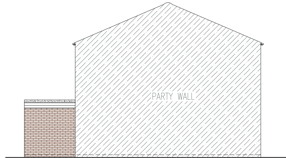
FLANK ELEVATION (SOUTH) SCALE 1:100