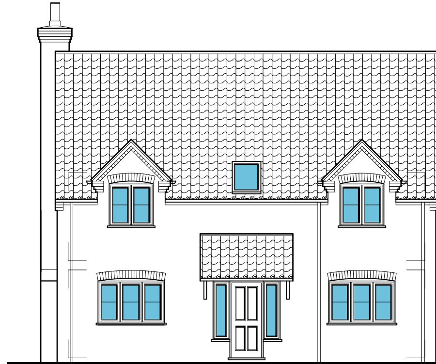
Proposed Principal (West) Elevation